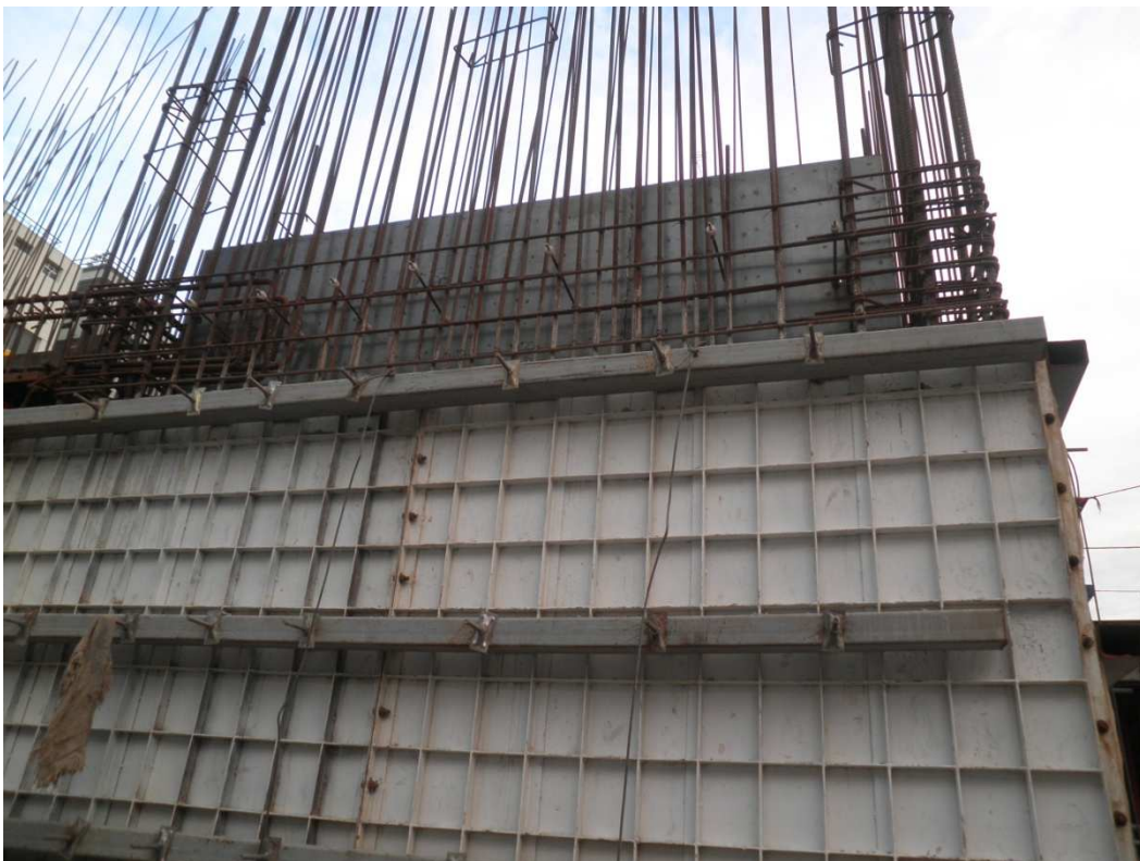
Shear wall Shuttering (Photographs taken : 24 Aug 2011 05:56 PM)