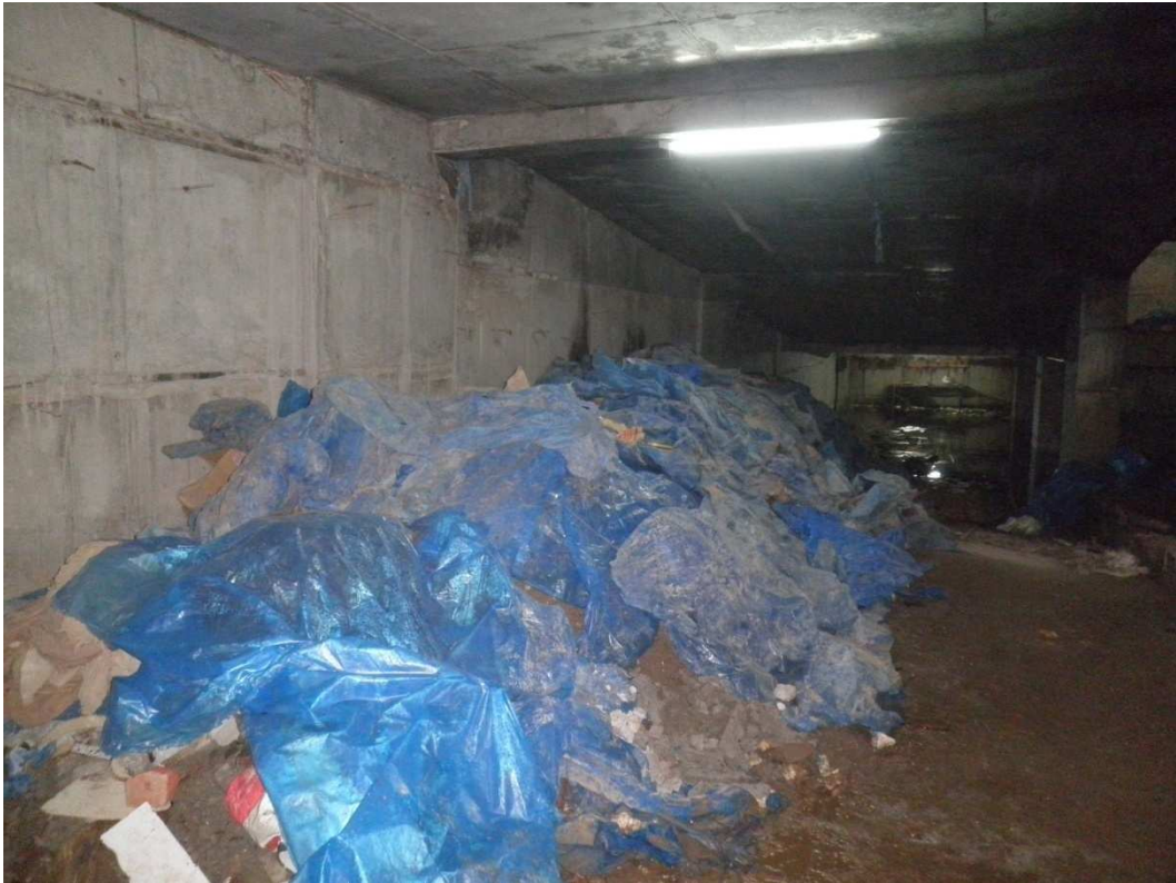
Garbage at Basement (Photographs taken 24 Aug 2011 05:50 PM)