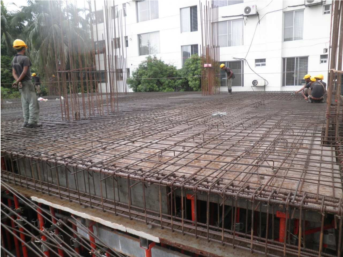
Photograph taken 24 August 2011 01:05 PM