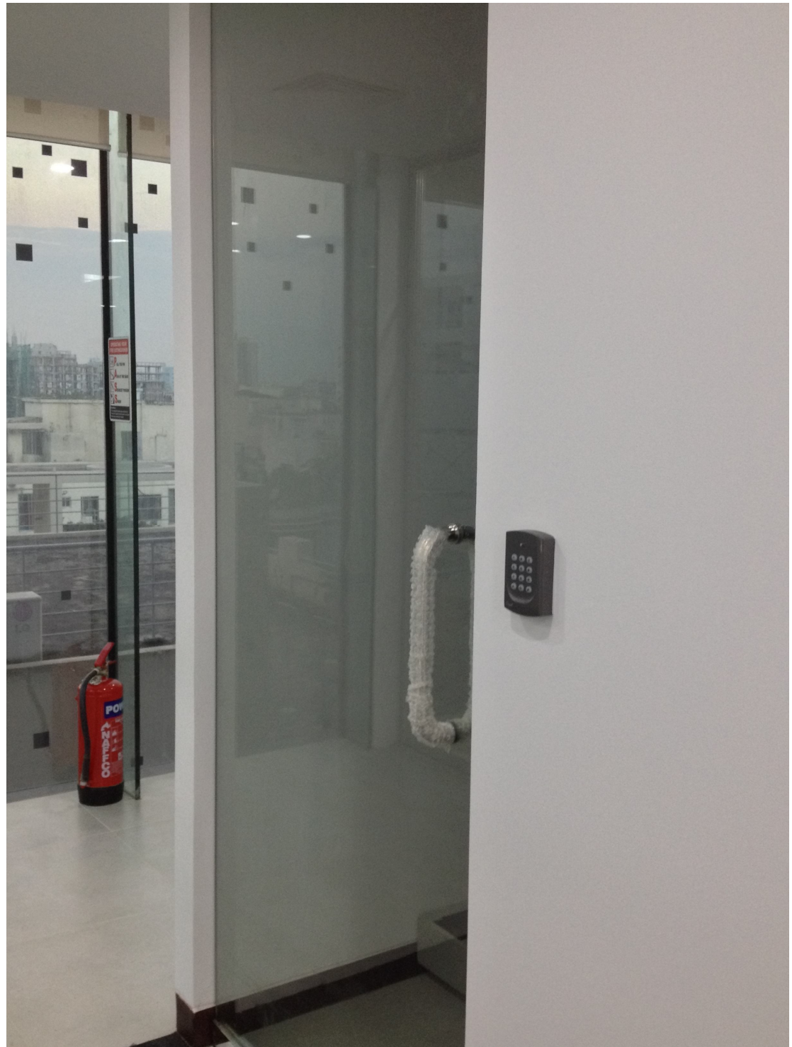
Taken: 31 Oct 2016 05:22 PM