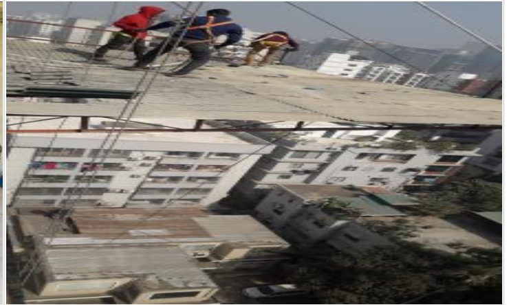
13F-External Safety Tray Removing on 01-02-21