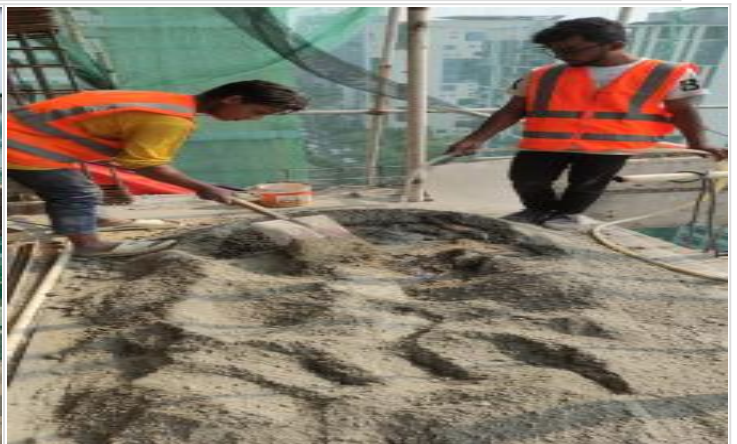
L-16-Column concrete mixing on 05-04-23