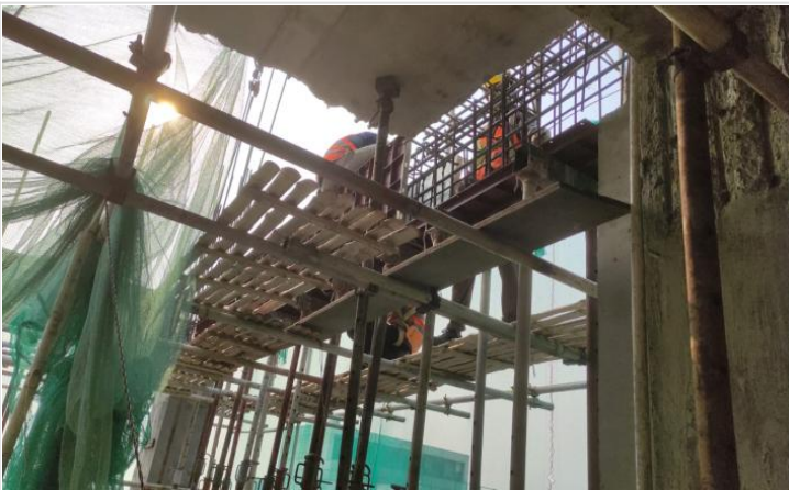
L-16-Beam shuttering on 18-04-23