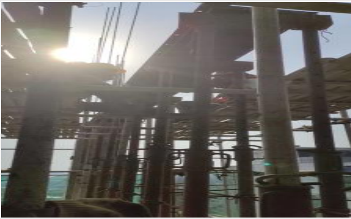
L-16-Beam bottom shuttering on 15-04-23