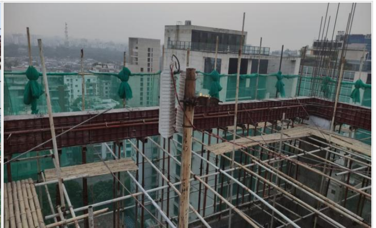
L-16-Beam concreting complete on 19-04-23