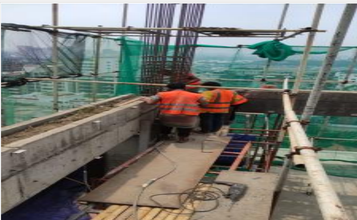
L-16-Column Re-bar on 05-04-23