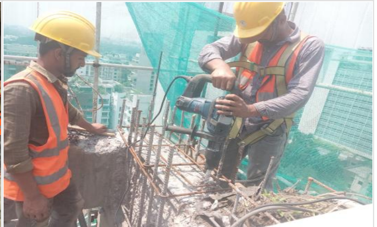
L-16-Re-bar fixing on 02-04-23