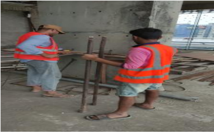
L-16-Column Stirrups making on 01-04-23