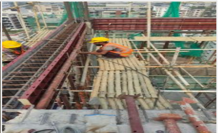
L-16-Beam shuttering on 18-04-23