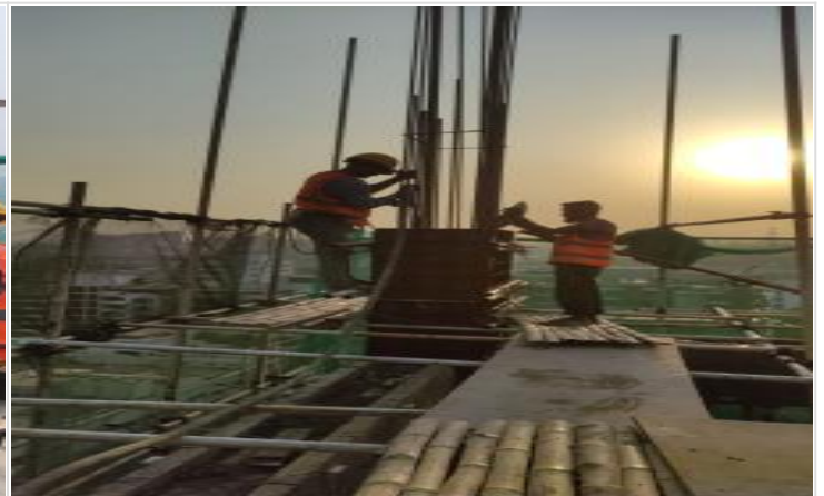
L-16-Column shuttering on 11-04-23