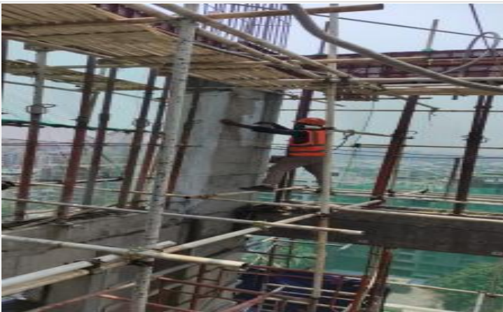
L-16-Column curing chemical applying on 19-04-23