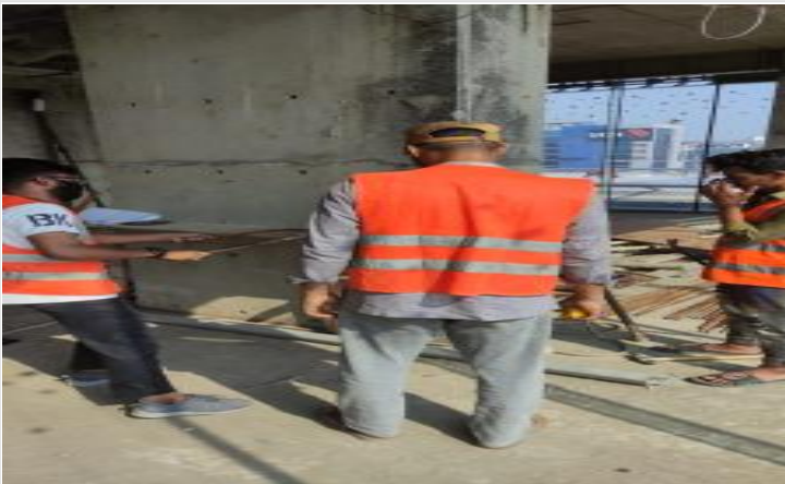
L-16-Column Stirrups making on 02-04-23