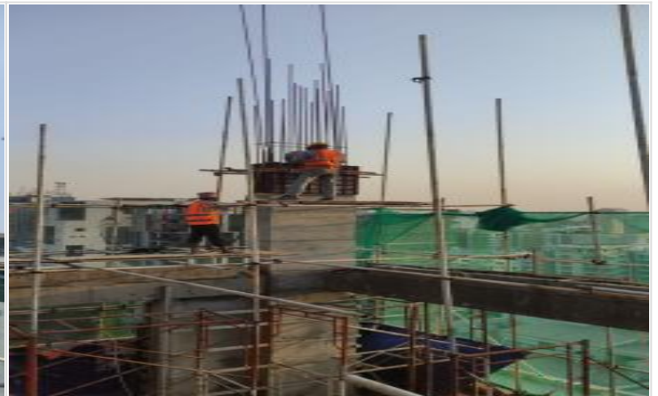
L-16-Column shuttering on 13-04-23