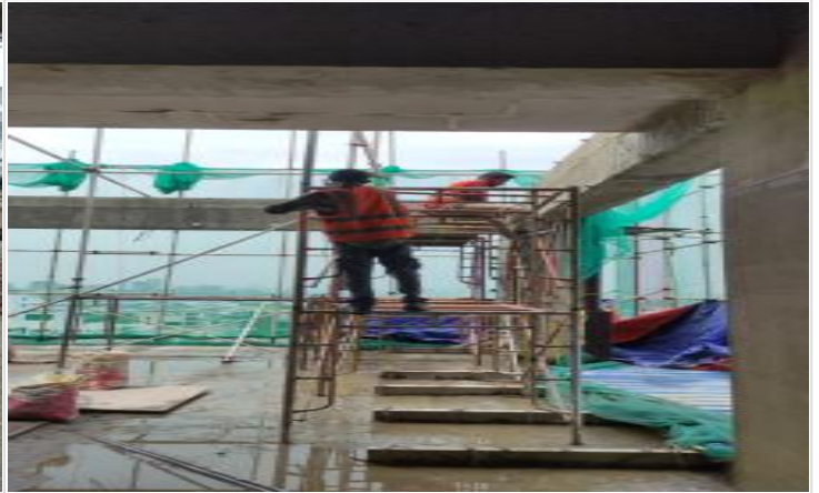
L-16-Scaffolding on 01-04-23