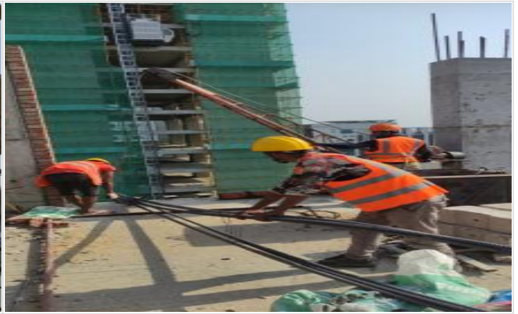
L-16-Beam Re-bar fabrication on 15-04-23