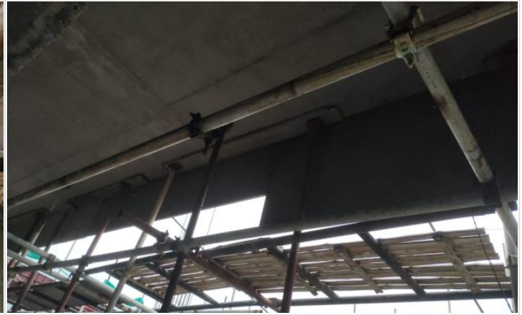
L-16-Beam Shutter removing on 29-04-23