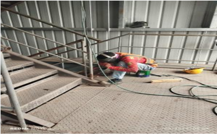
Stair Railing fixing on 22-03-25