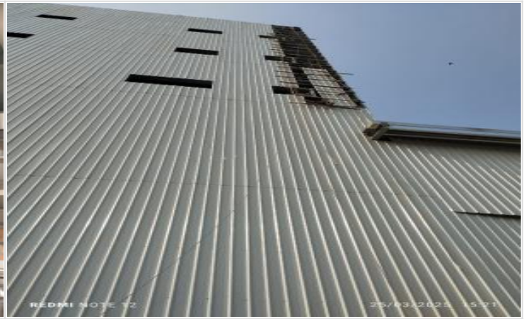
Interior painting on 25-03-25 Site sheeting on 25-03-25