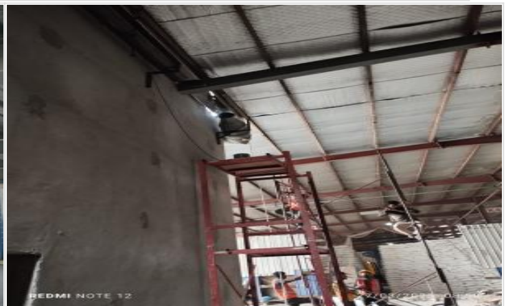
Interior painting on 27-03-25 Interior painting on 27-03-25