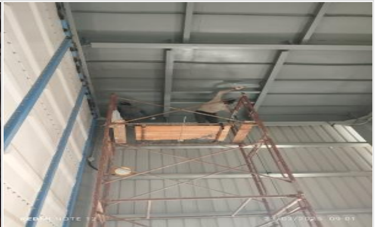
Interior painting work on 23-03-25