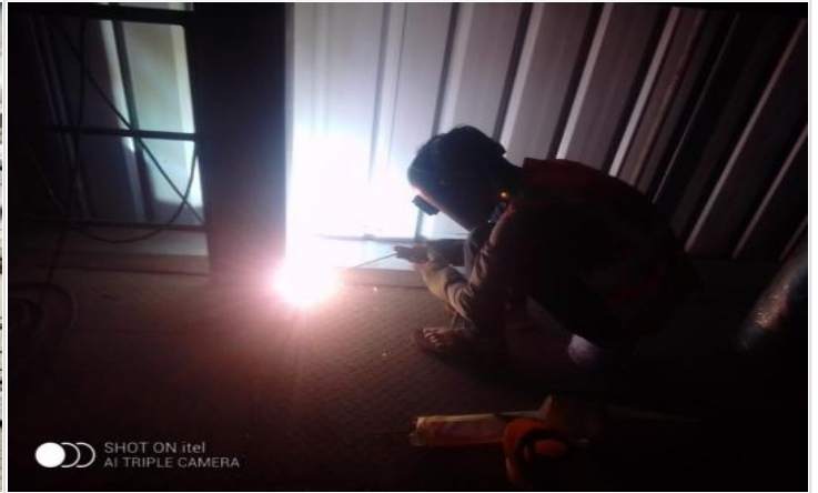
Welding work on 22-03-25