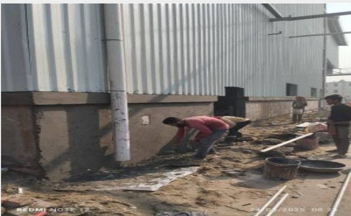
Exterior wall plastering on 24-03-25