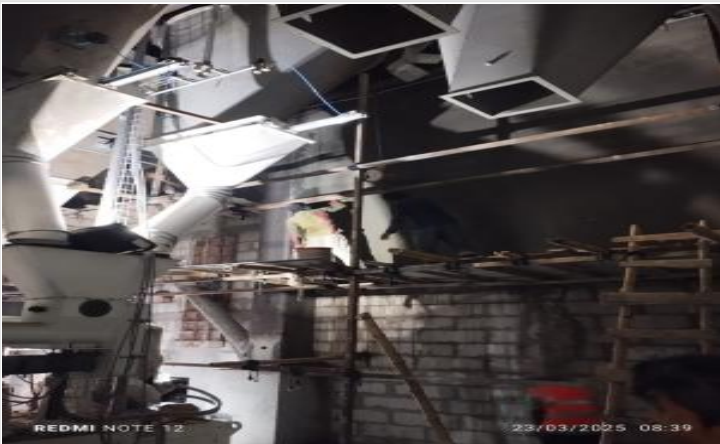
Interior AAC block work on 23-03-25