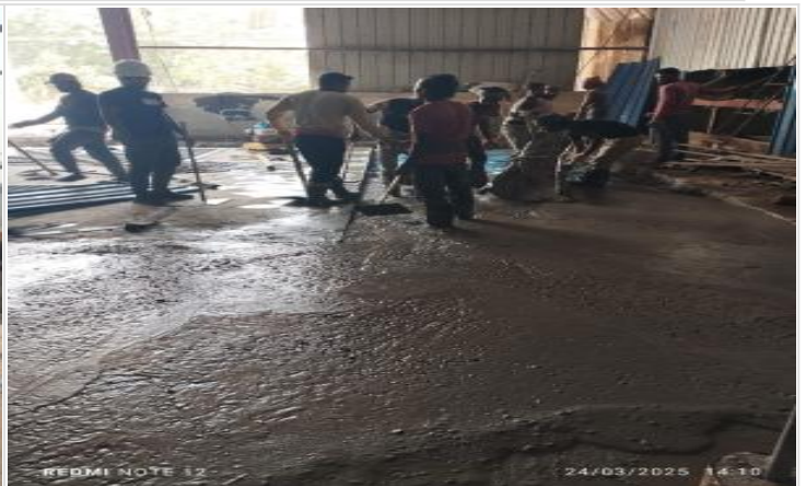
Roof top concreting on 24-03-25