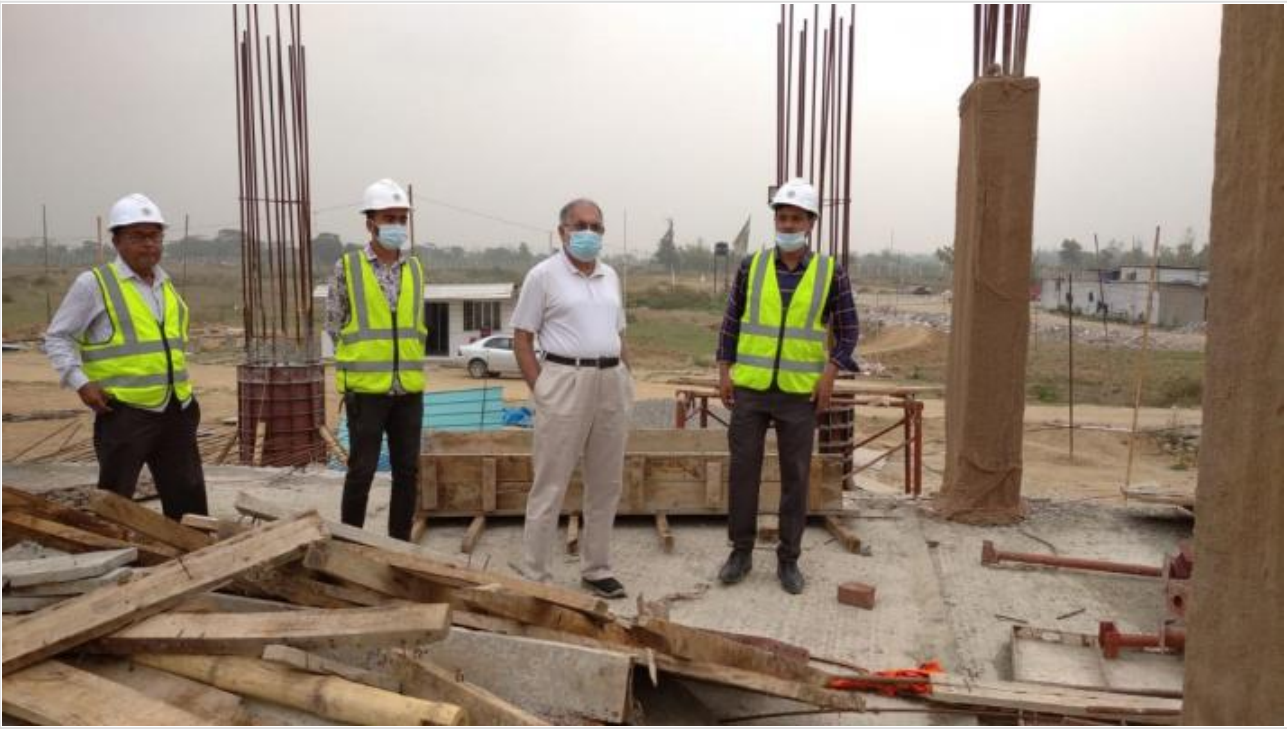
G.M. Construction Visit on 28-04-21