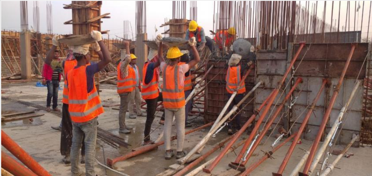
Retaining wall and Column Concreting on 28-01-21