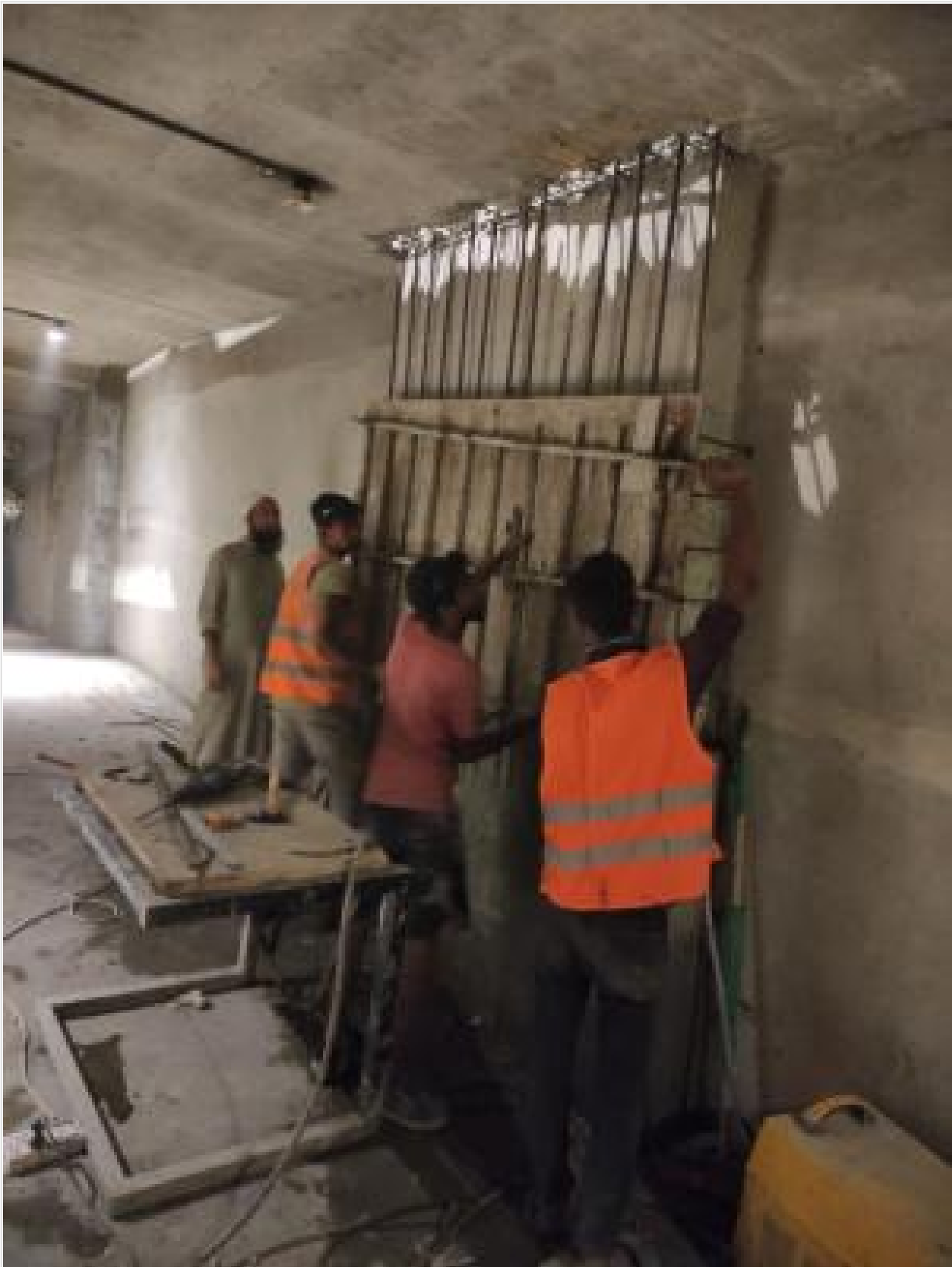
B-2-Column retrofit shuttering on 02-04-23