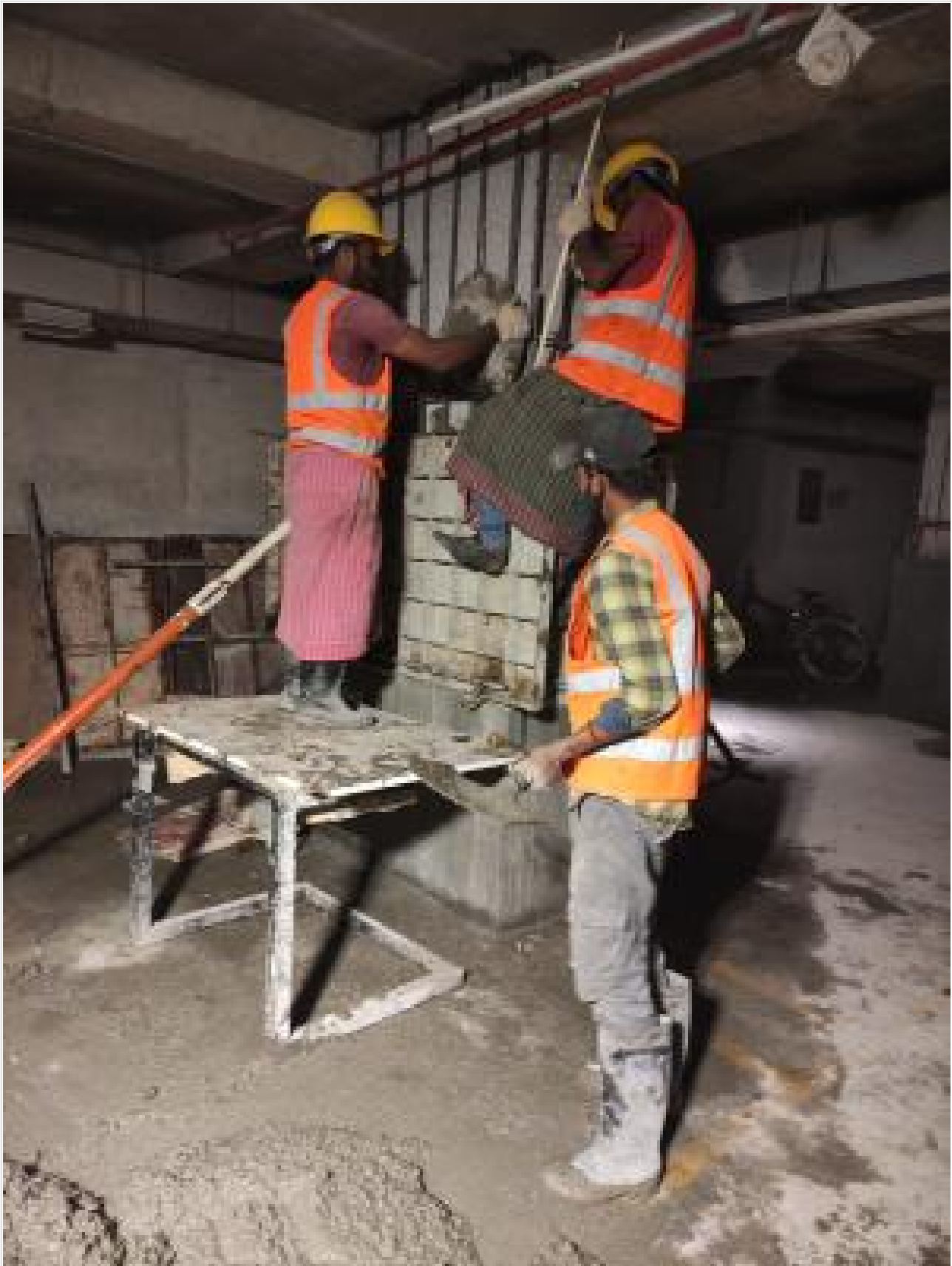
B-2-Col Re-bar work on 18-02-23