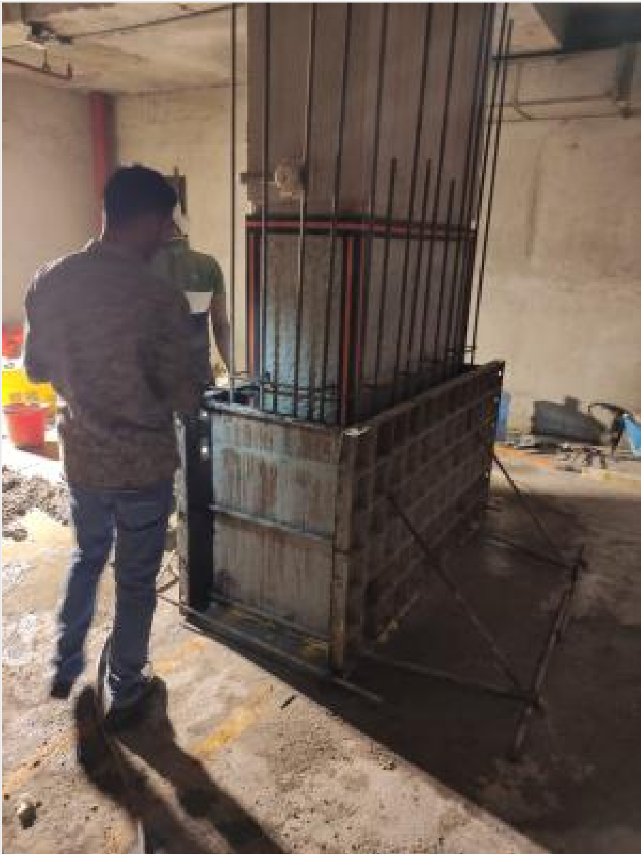
Basement-2-Column retrofitting on 08-02-23