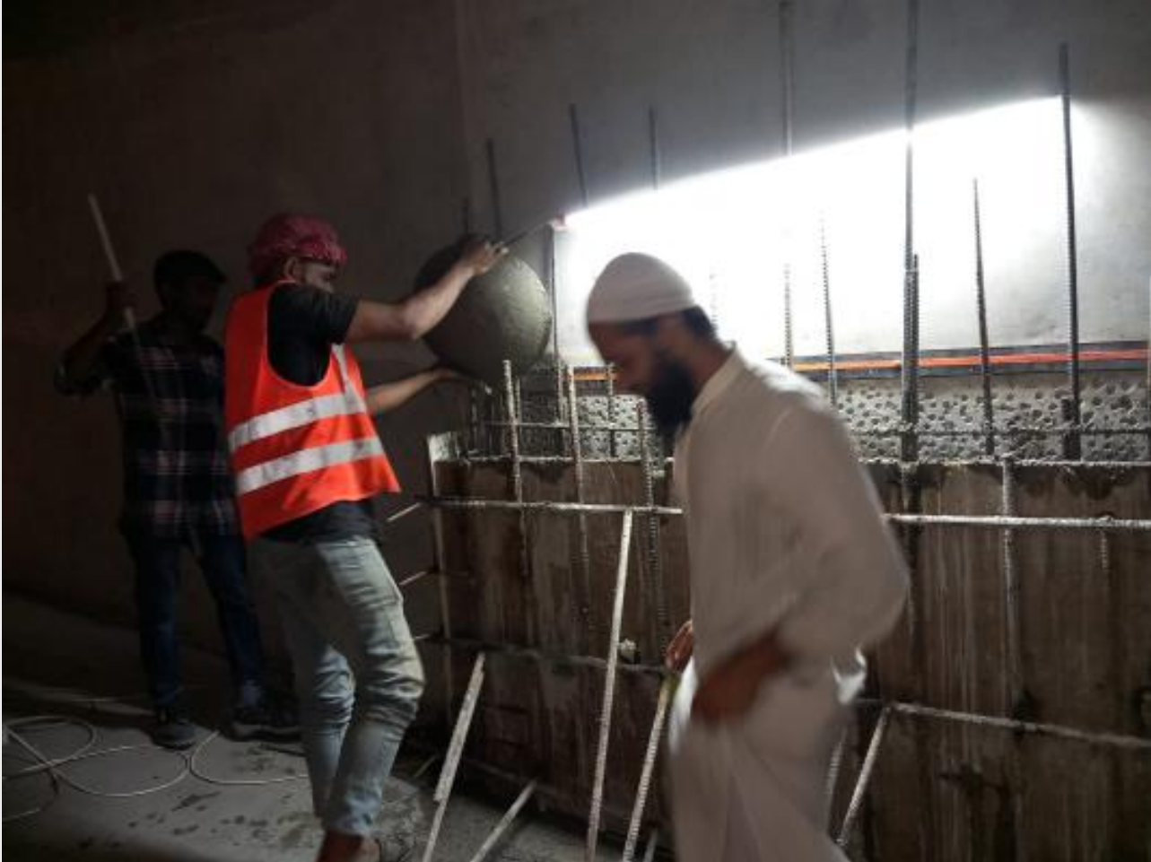
B-2-Column retrofit concreting on 29-03-23