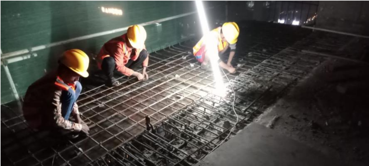
L-17 Slab Extension Re-bar Work on 22-12-22