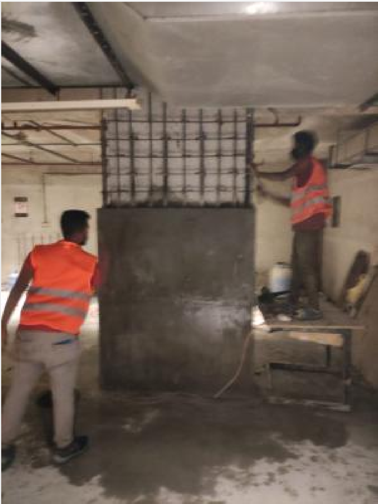
B-2 Col retrofit re-bar work on 22-02-23