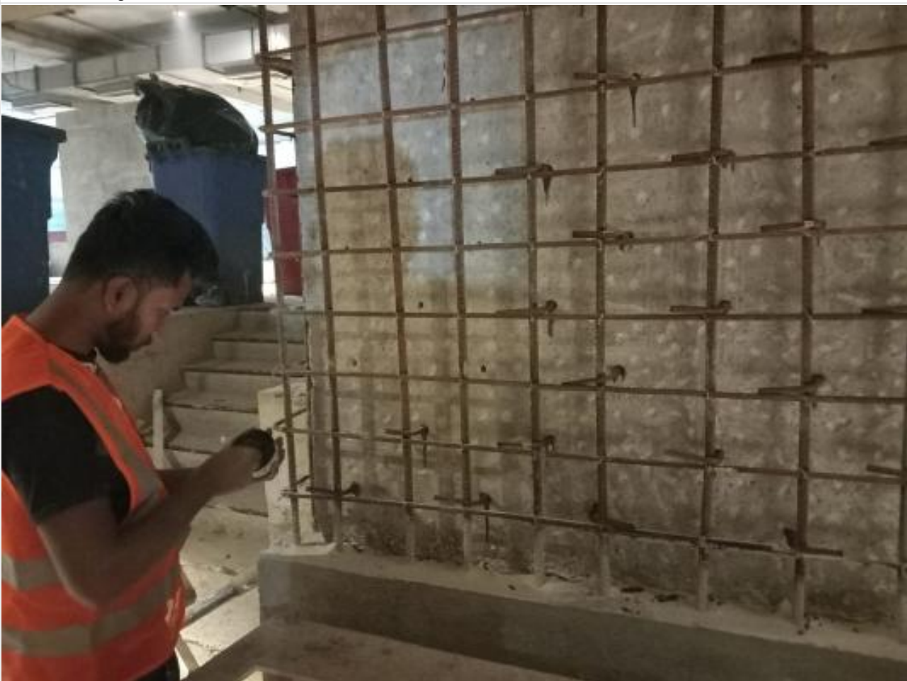
Shear Wall Retro. on 05-02-23