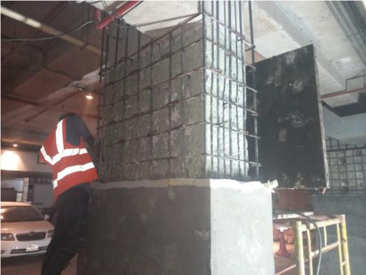
B-1-Column retrofit re-bar work on 09-03-23