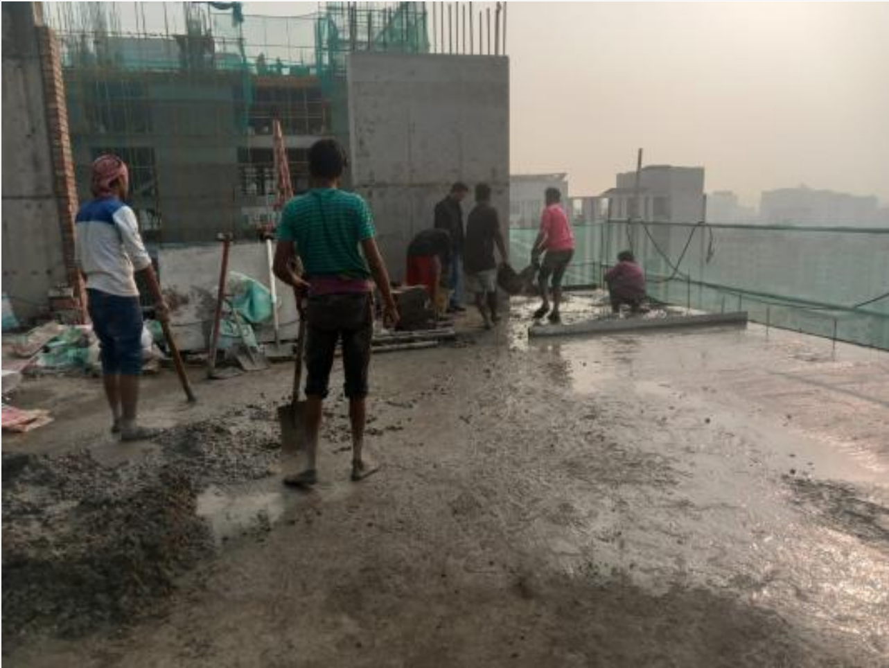
Level-17-Slab Extn Concreting on 28-12-22