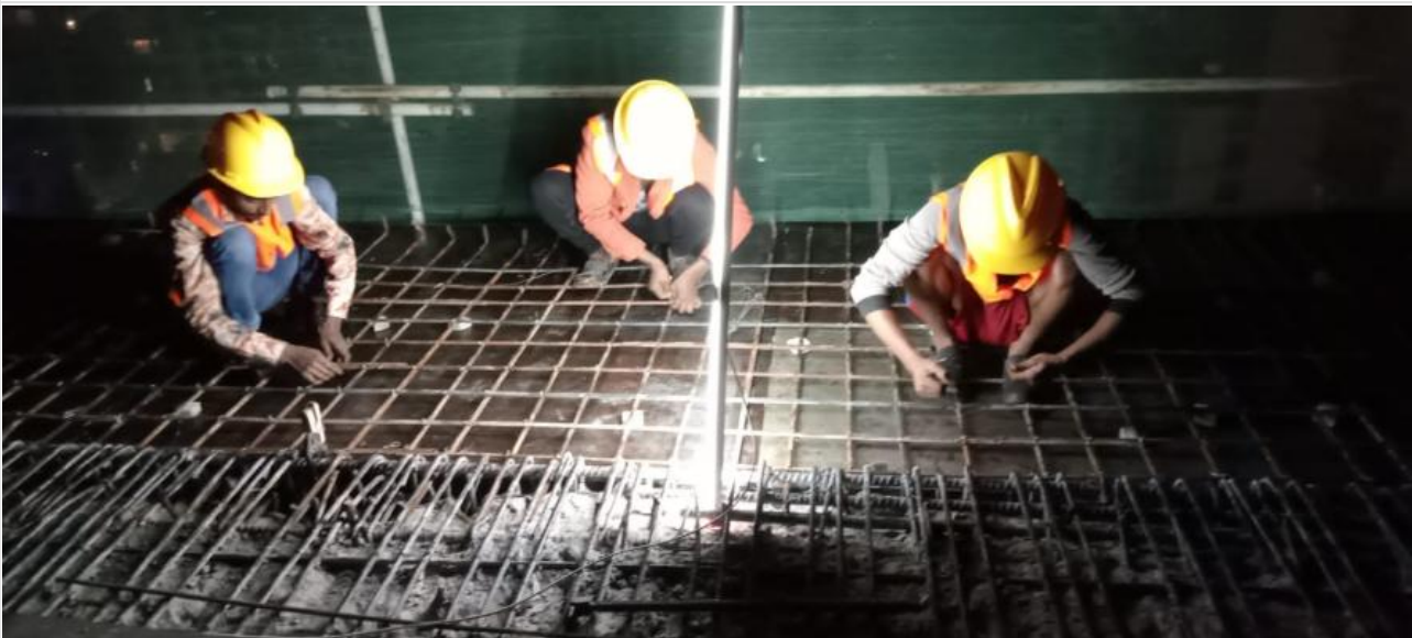
L-17 Slab Extension Re-bar Work on 22-12-22