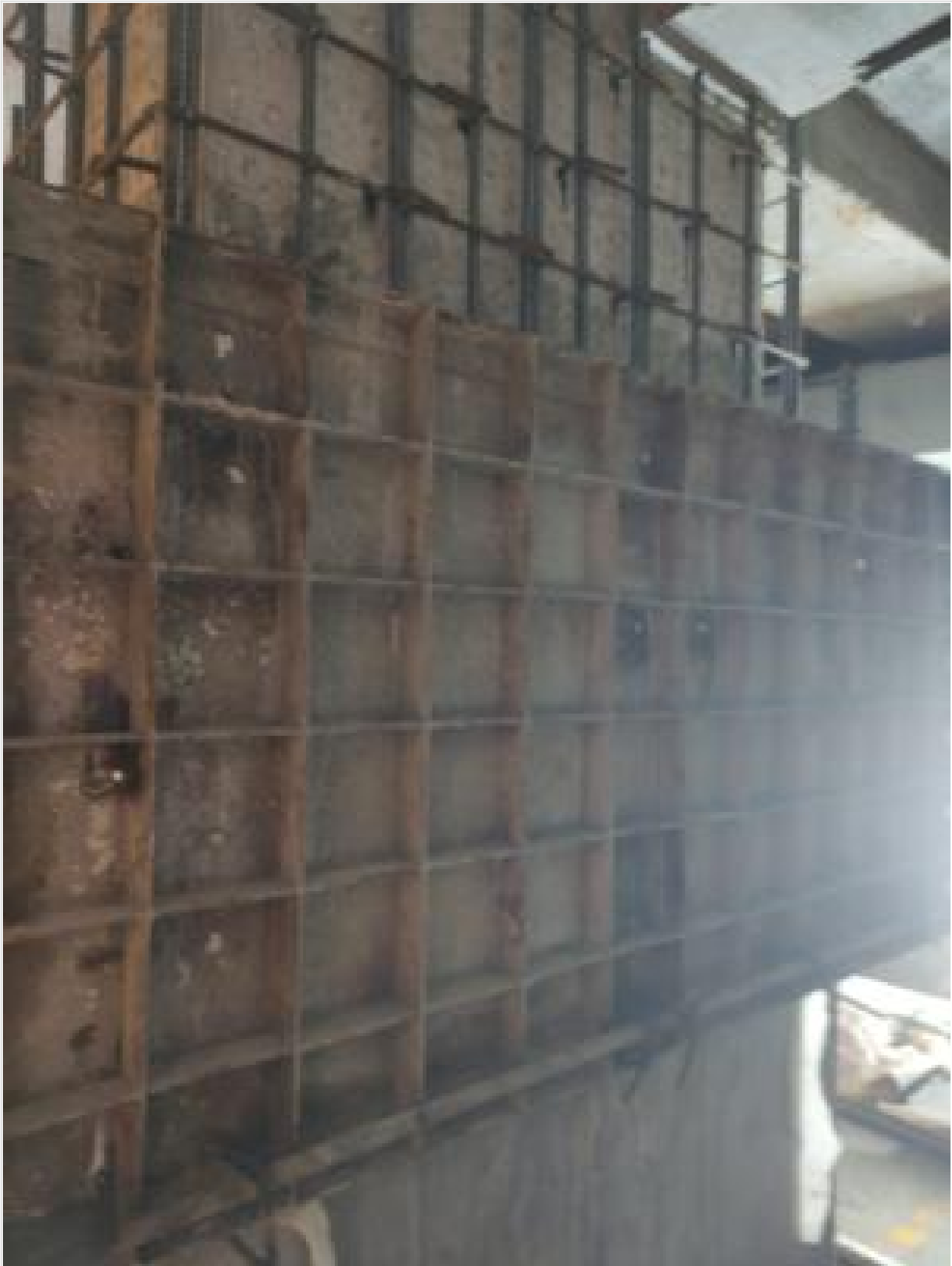
Retrofit-B-2 Column Shuttering on 27-02-23