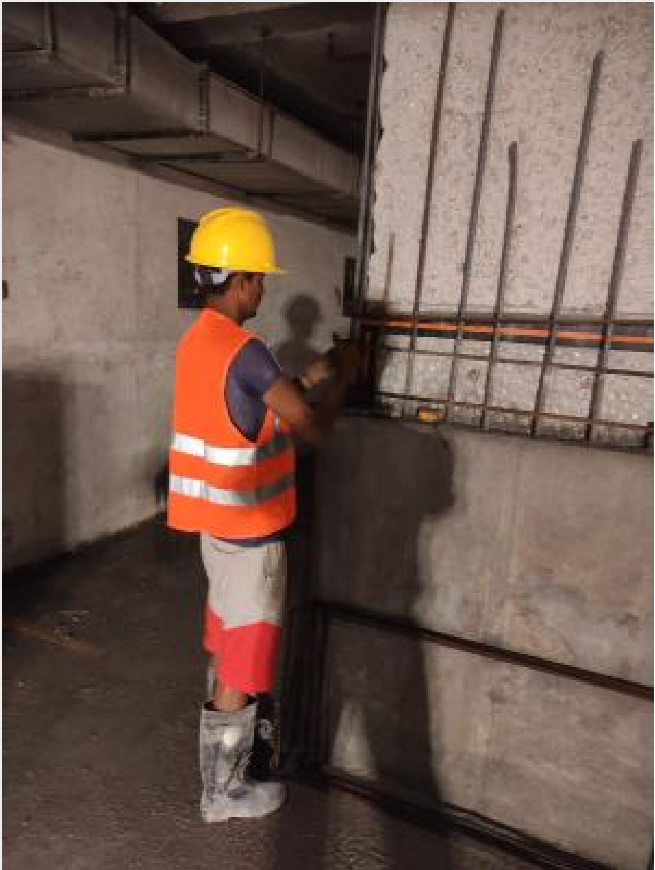
B-2 Col retrofit re-bar work on 20-02-23