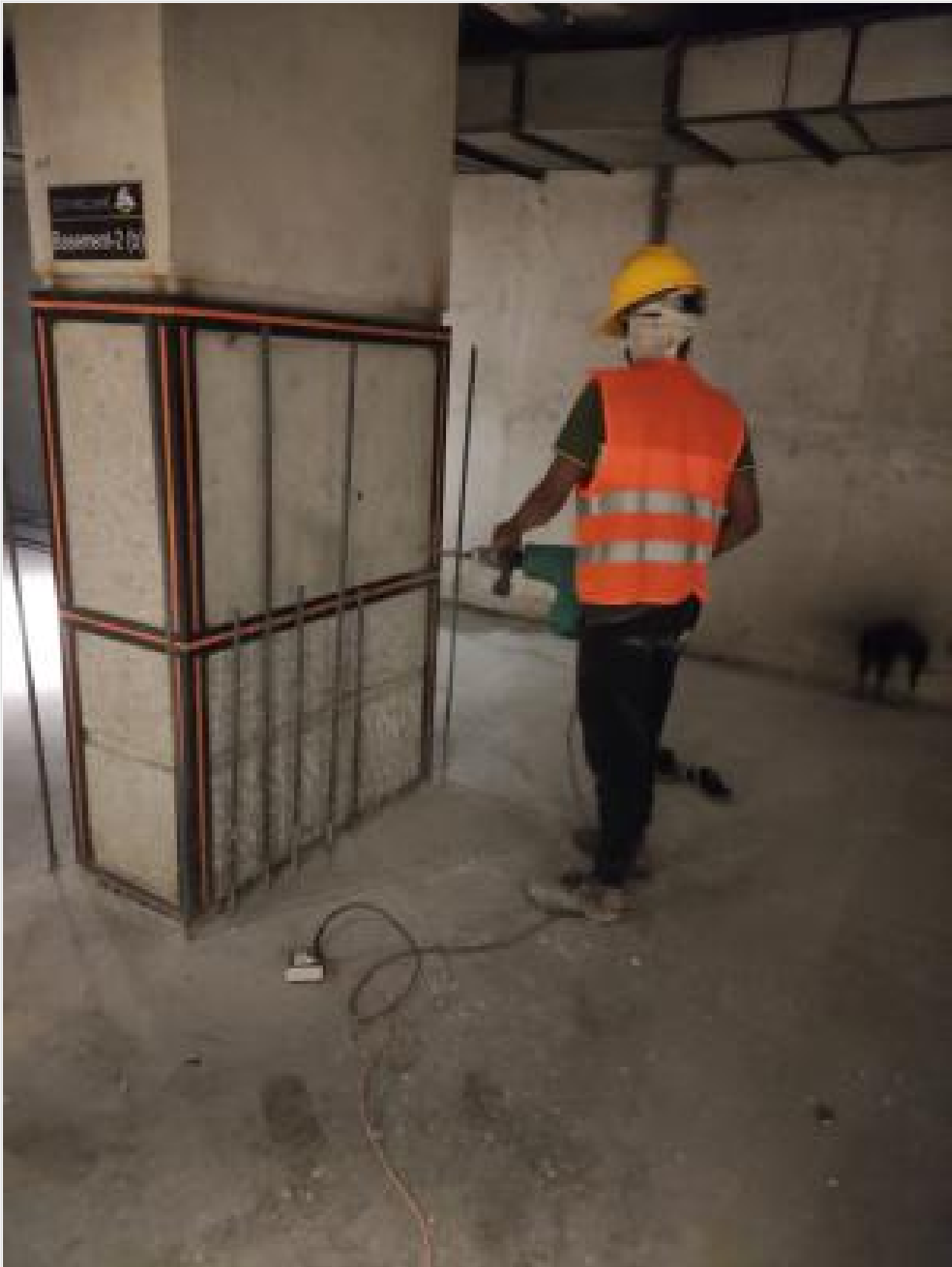
Basement-2-Column retrofitting on 08-02-23