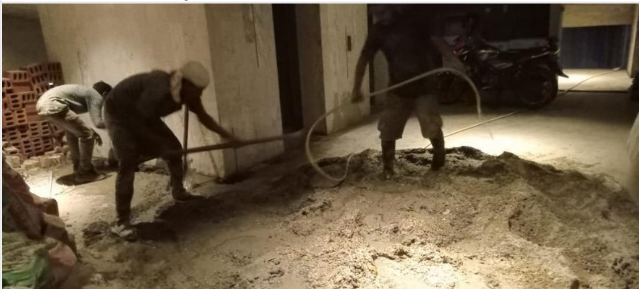
Basement-3 Lift-wall Concreting on 09-01-23