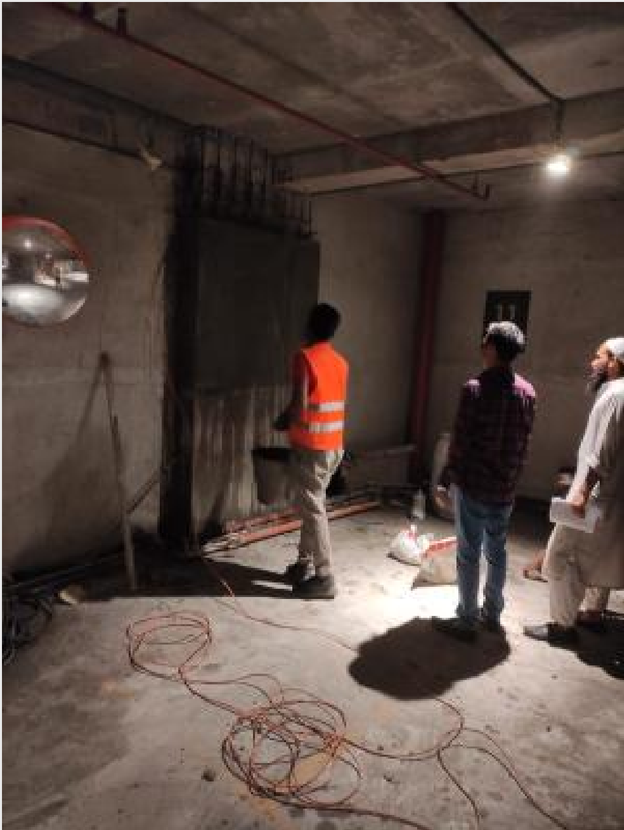
B2-Col Retrofit re-bar work on 22-02-23