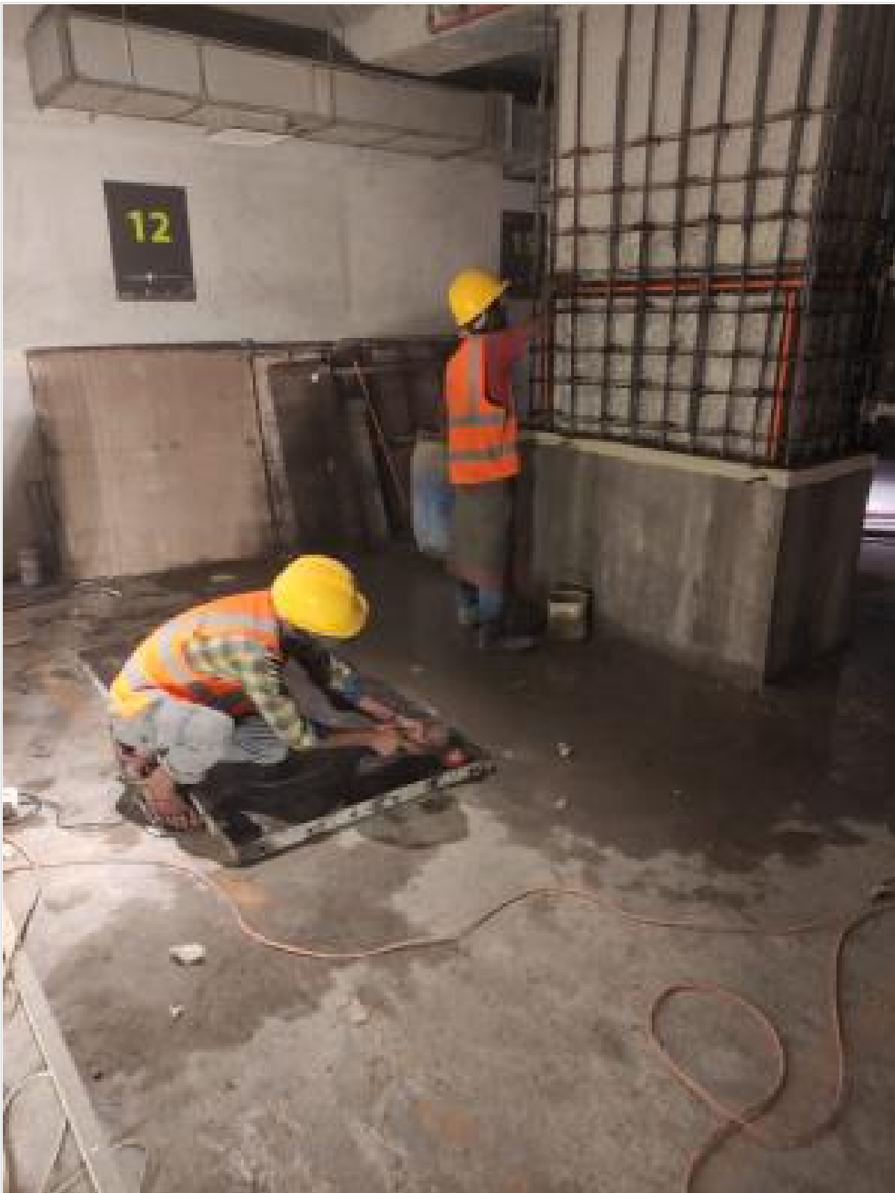
B2-Column Shuttering on 18-02-23