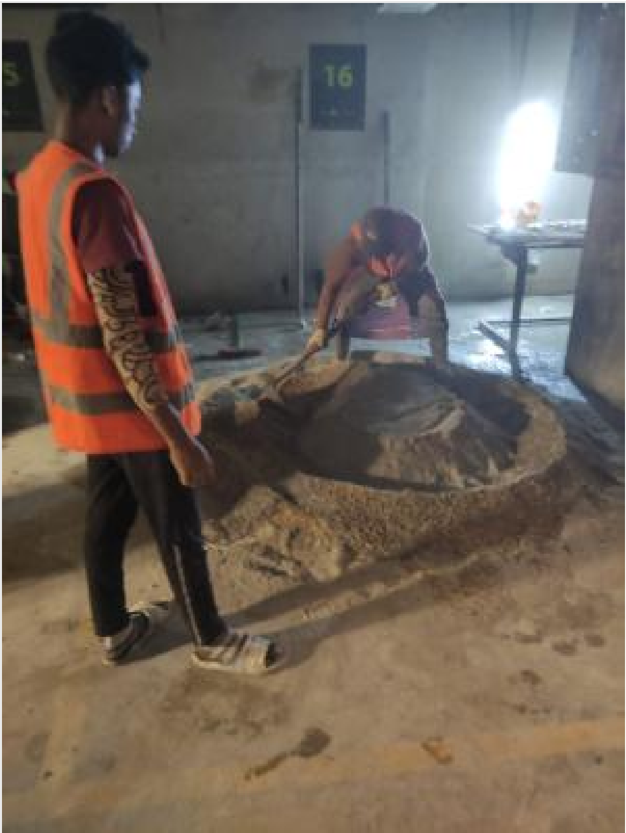
Retrofit-B2-Column Concrete on 27-02-23