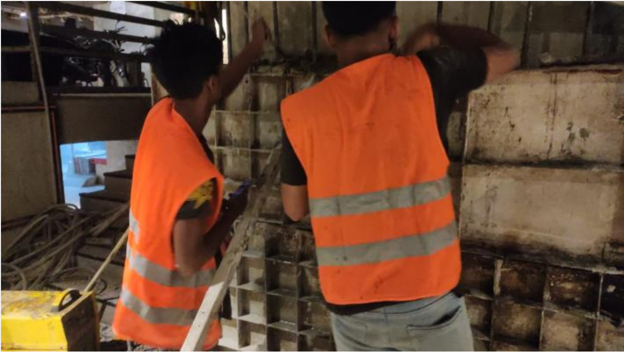
B-2-Column Retrofit shutter removing on 27-03-23