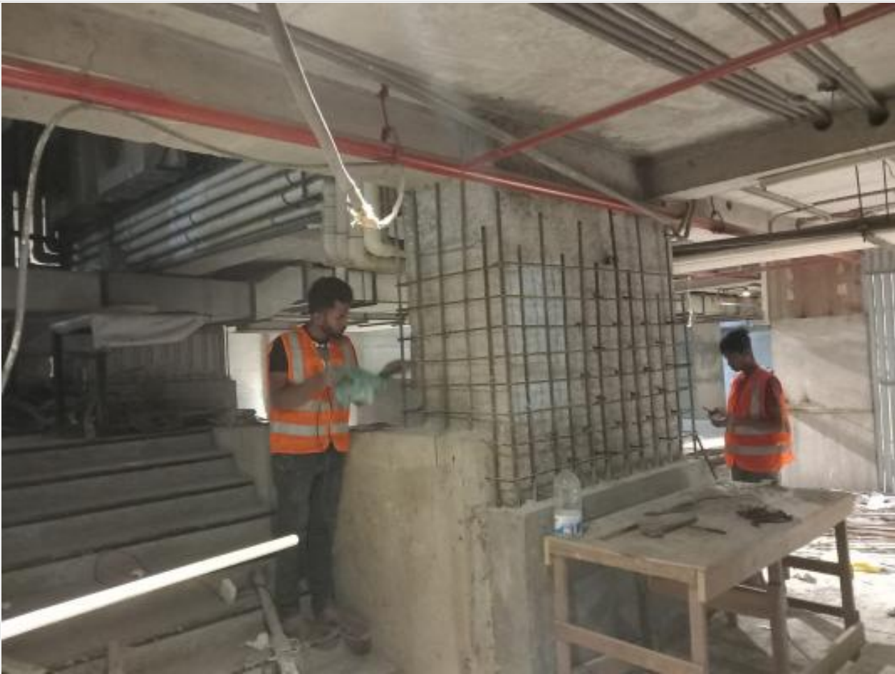
Col.Retrofitting on 05-02-23