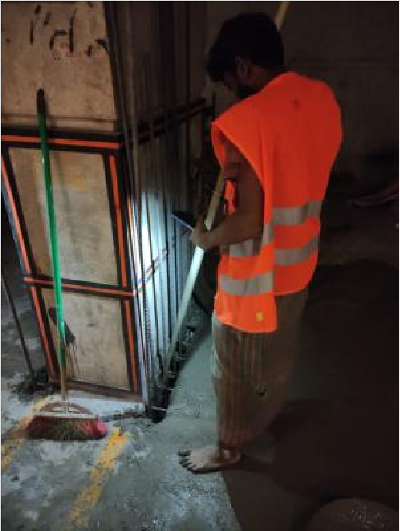
B-2-Column Retrofitting on 01-03-23