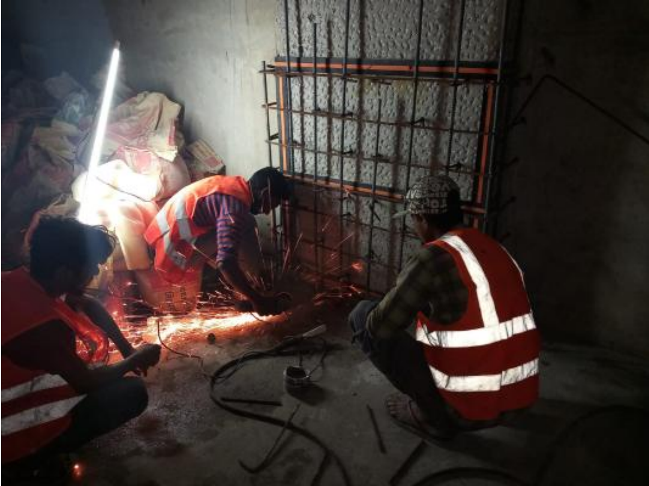
B2-Col Retrofit re-bar work on 04-03-23