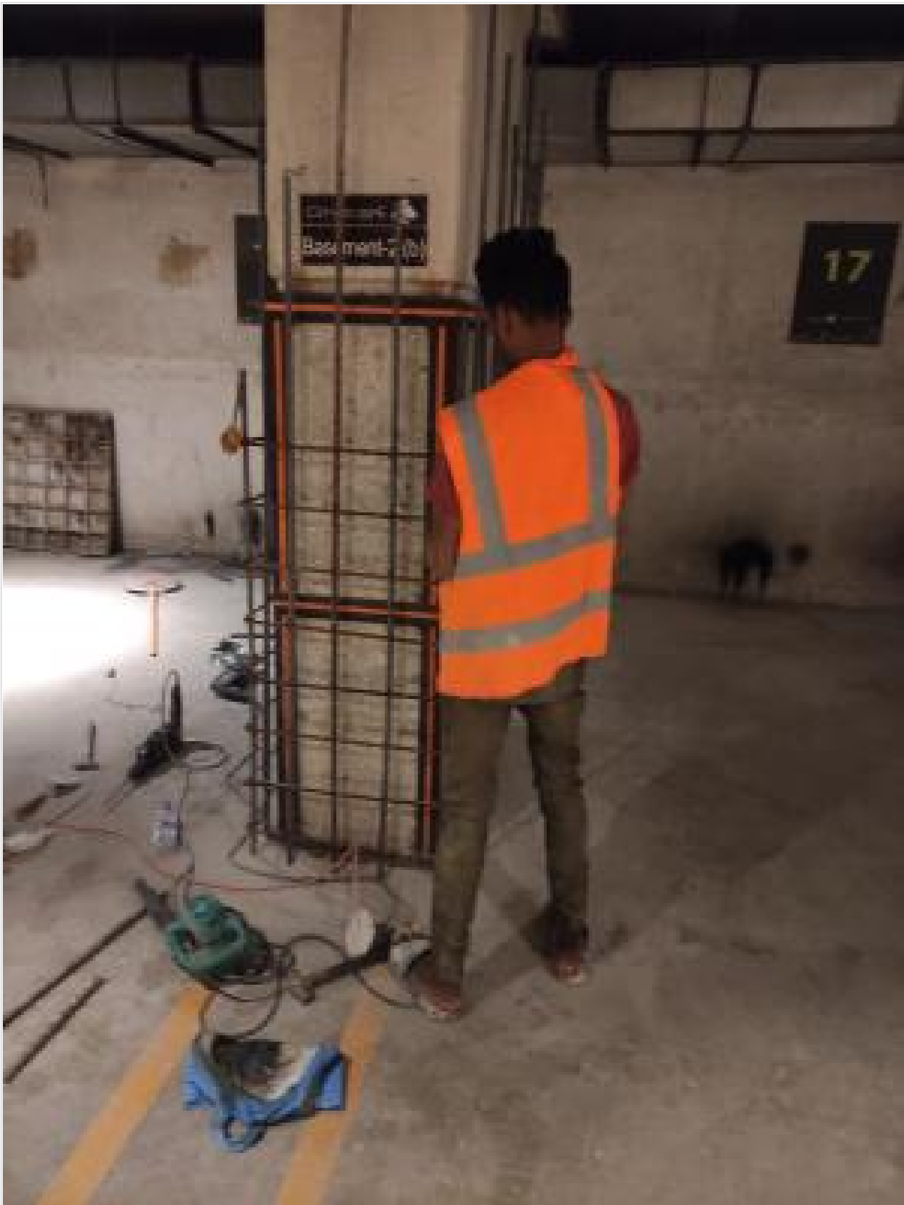
B-2 Col retrofit re-bar work on 15-02-23