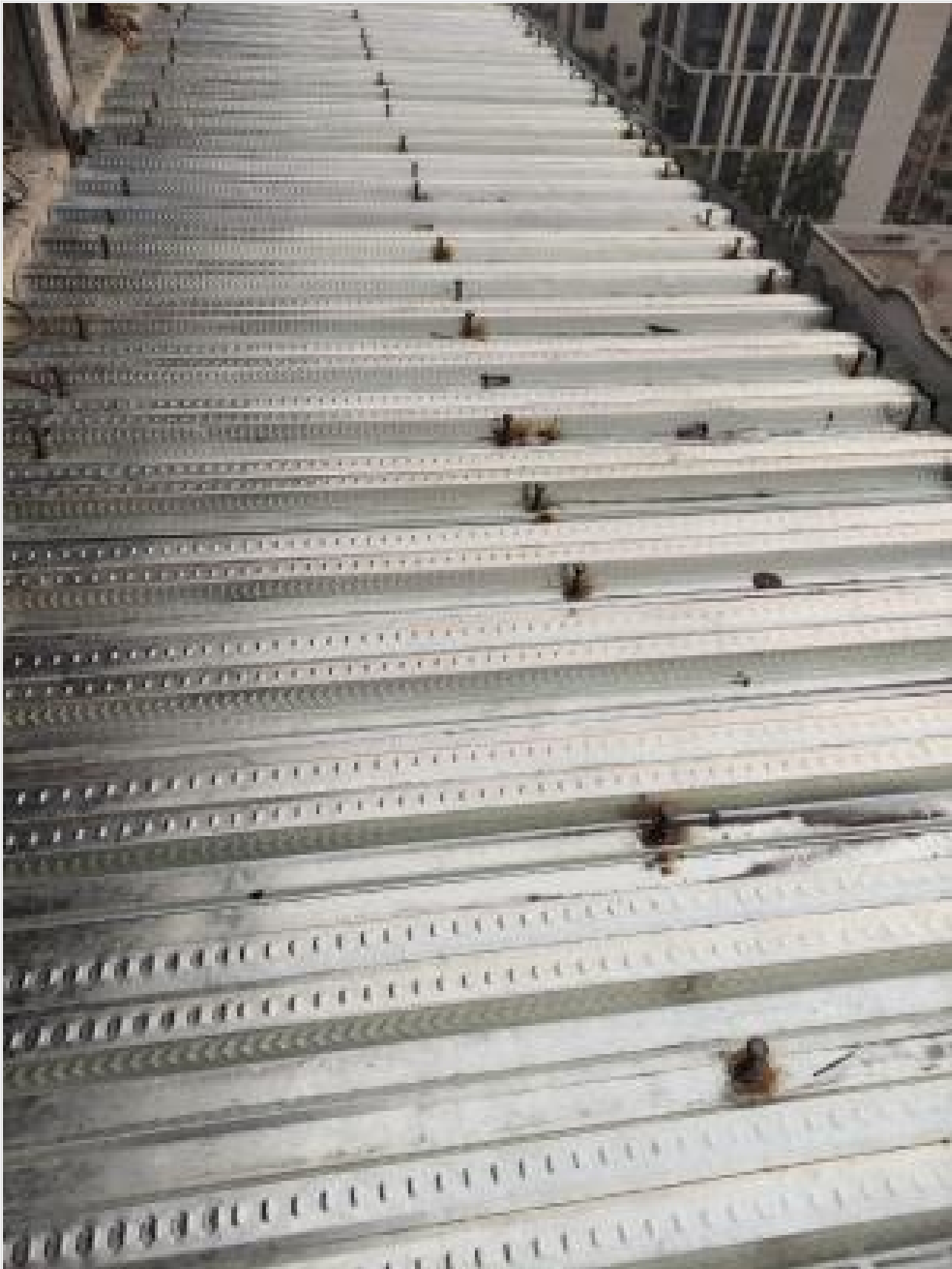
Level-14 Decking Slab complete on 13-02-23