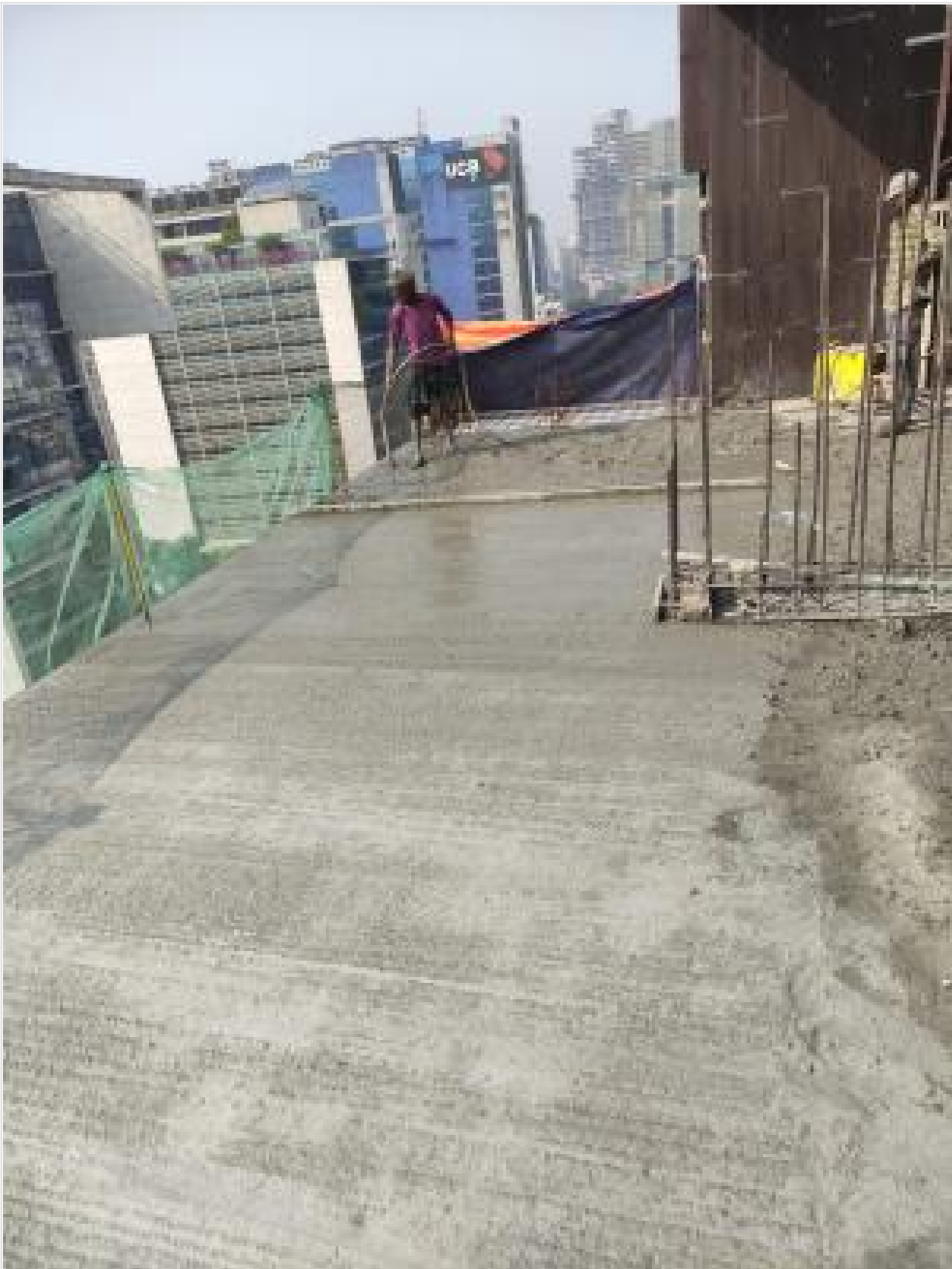
Level-15-Ext Slab Concreting on 25-02-23