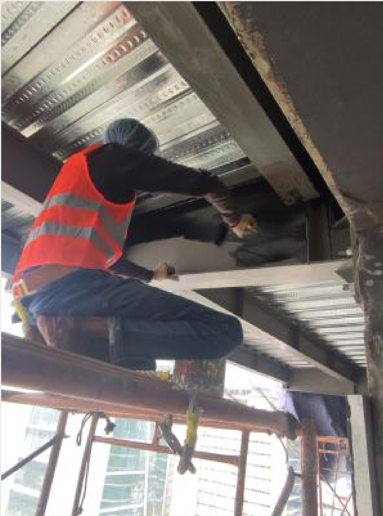
L-14-Ext Decking and Beam Painting on 27-02-23