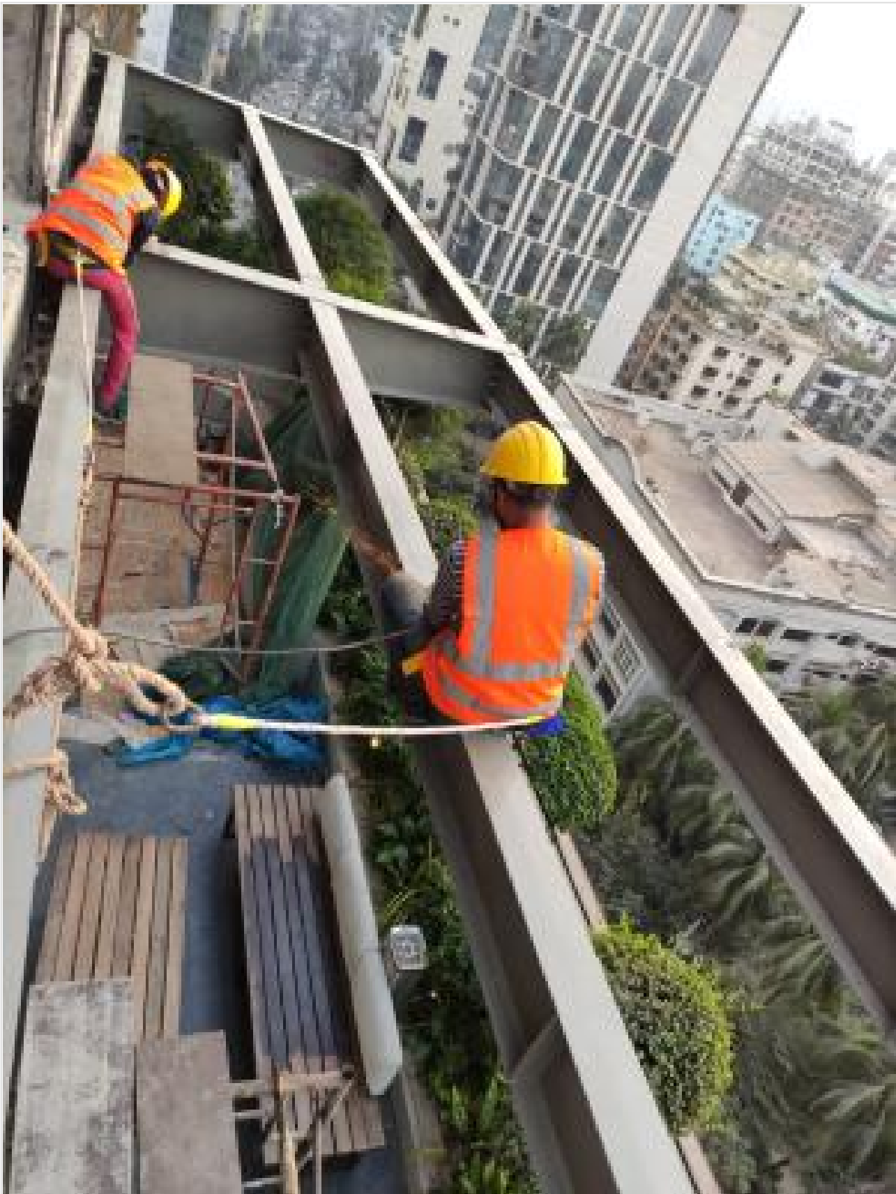
Level-14-Steel Work on 08-02-23