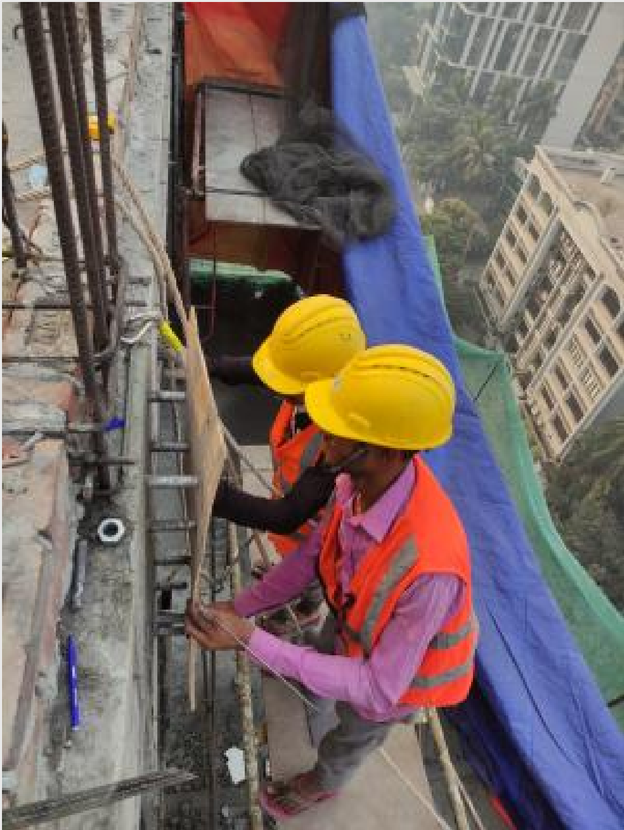
L-15-Steel Fabrication on 18-02-23