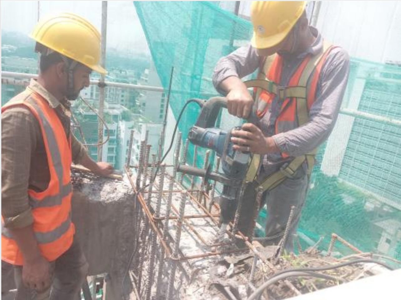
L-16-Re-bar fixing on 02-04-23