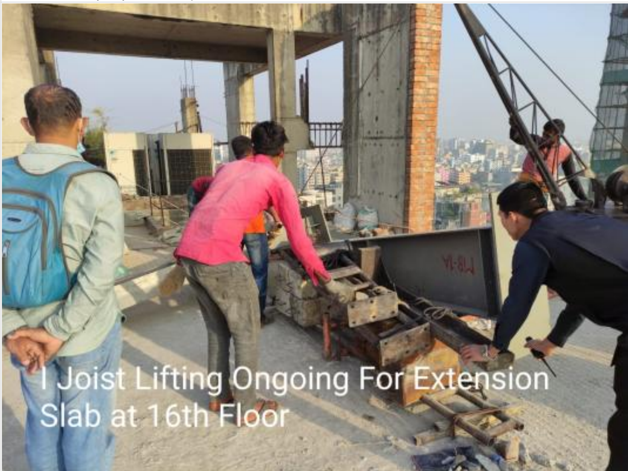
I-Joist Lifting on 16th Floor on 02-02-23