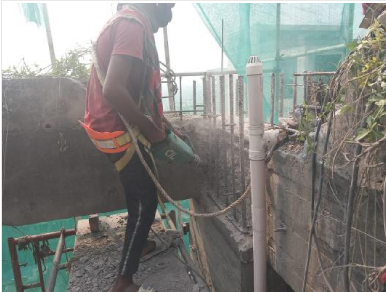
L-16-Old concrete removing on 22-03-23