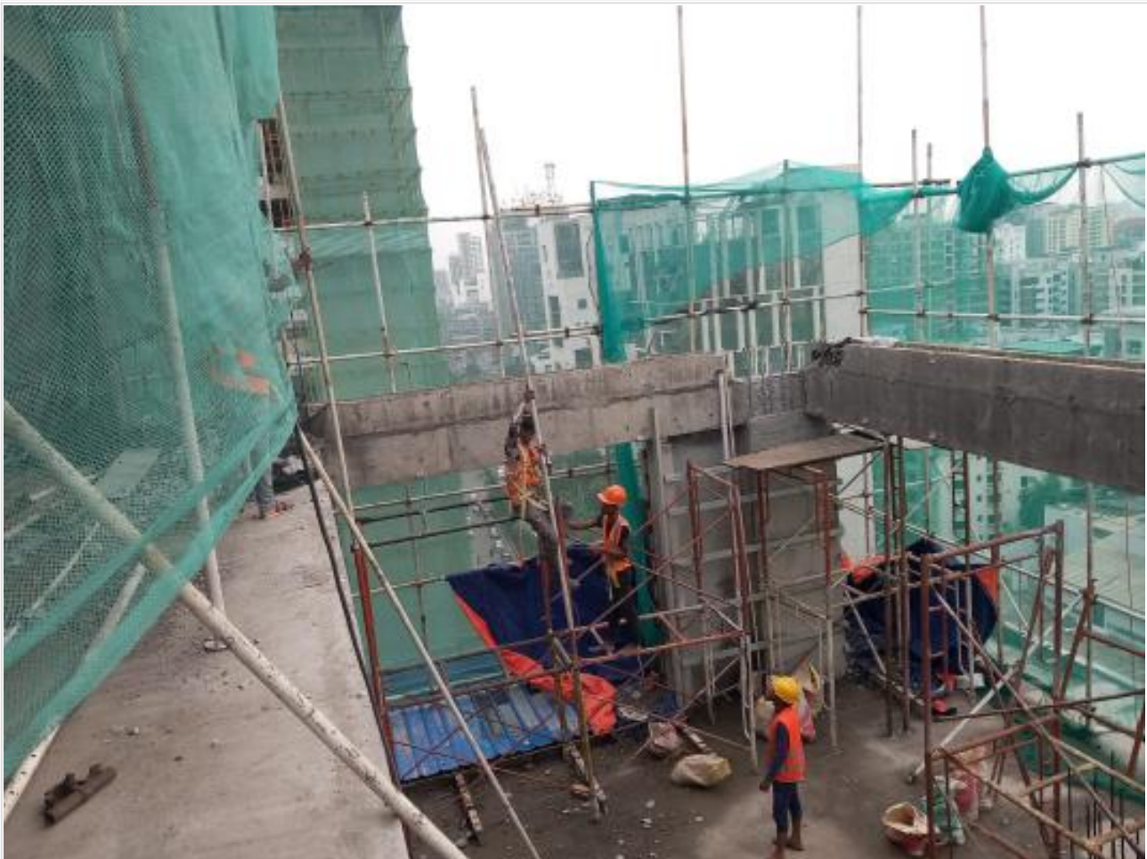
L-16-Scaffolding on 31-03-23