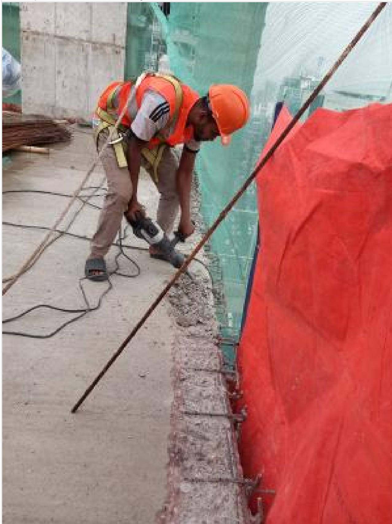
L-16-Dropwall old concrete dismantling on 29-03-23