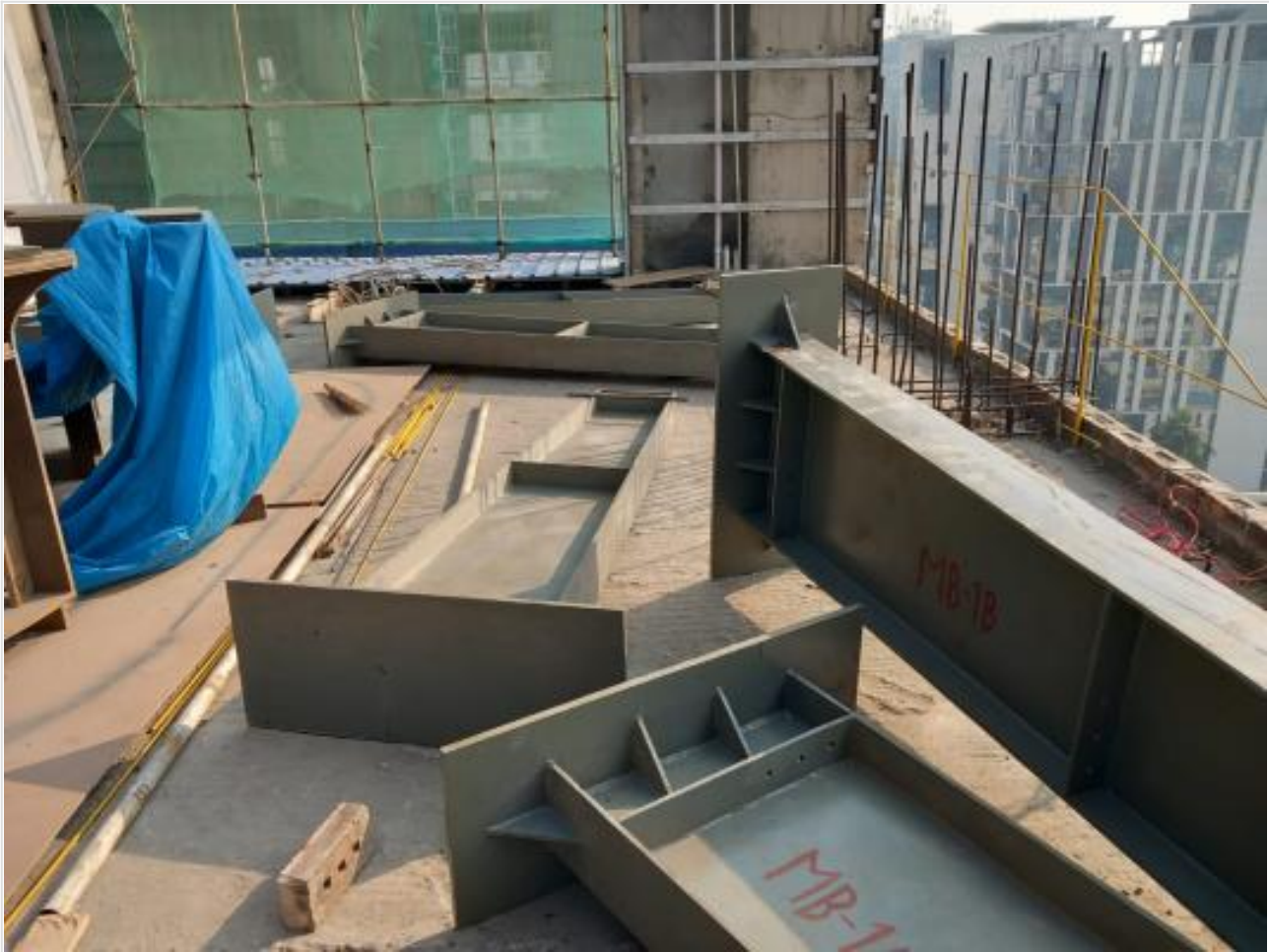
Keeping L-15 on 05-02-23