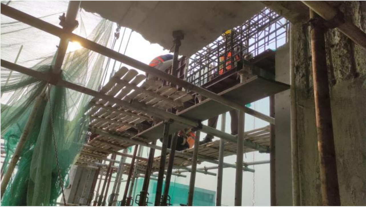
L-16-Beam shuttering on 18-04-23