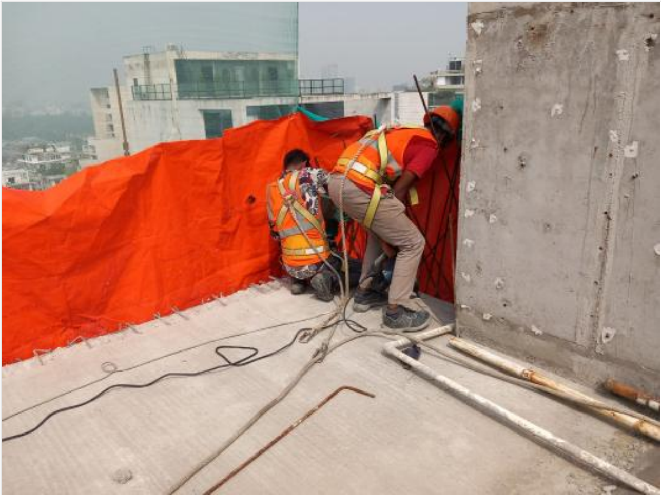
L-17-Slab chpping on 30-03-23