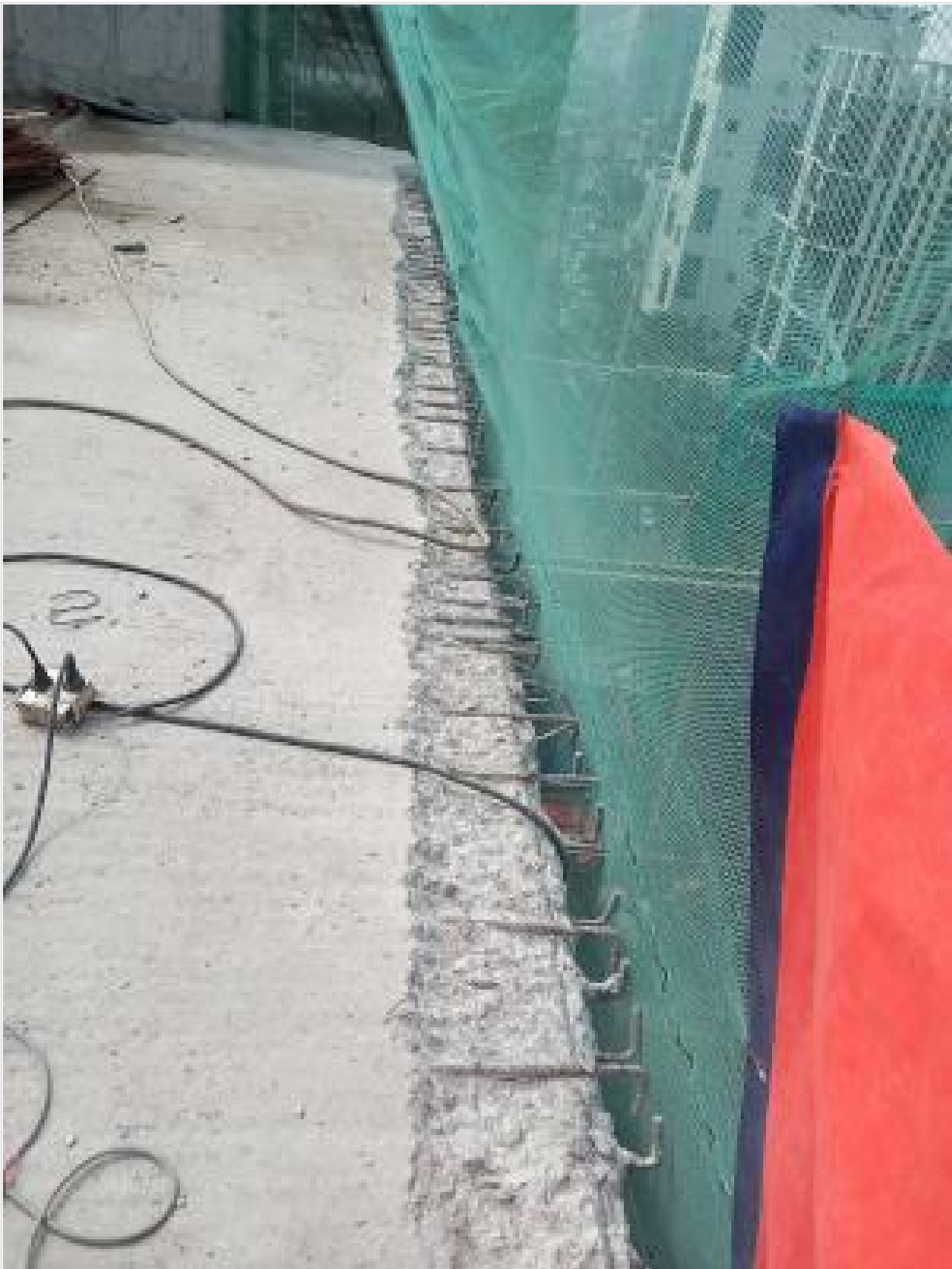
L-17-Slab chpping on 30-03-23