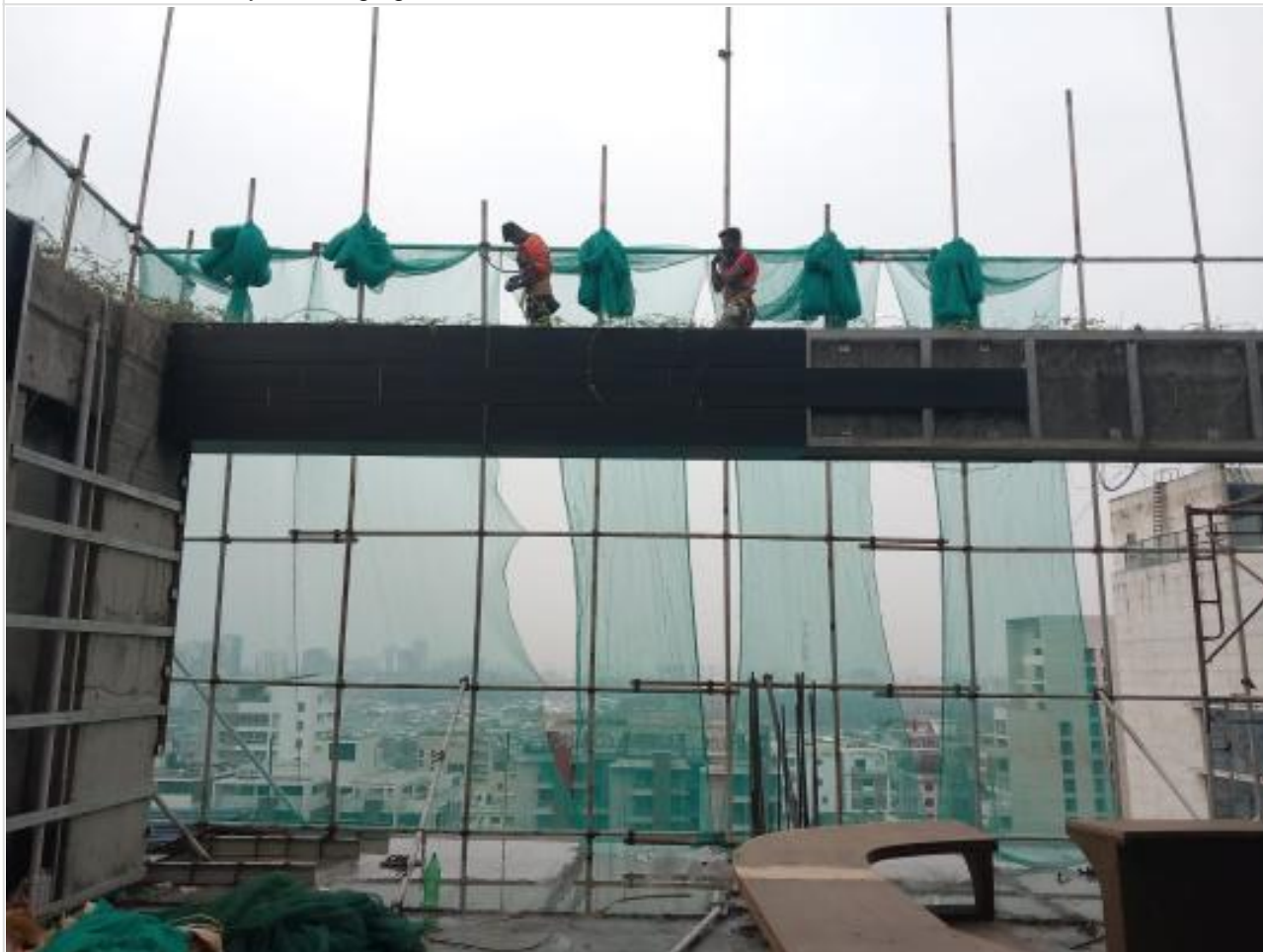
L-16-West side safety net hanging on 15-03-23