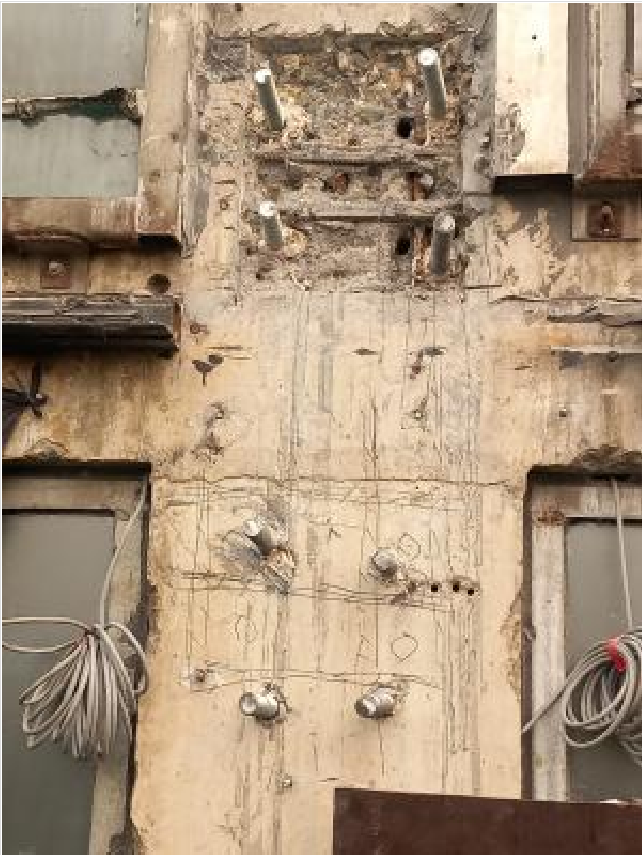
Chemical Bolt fixing on 26-01-23