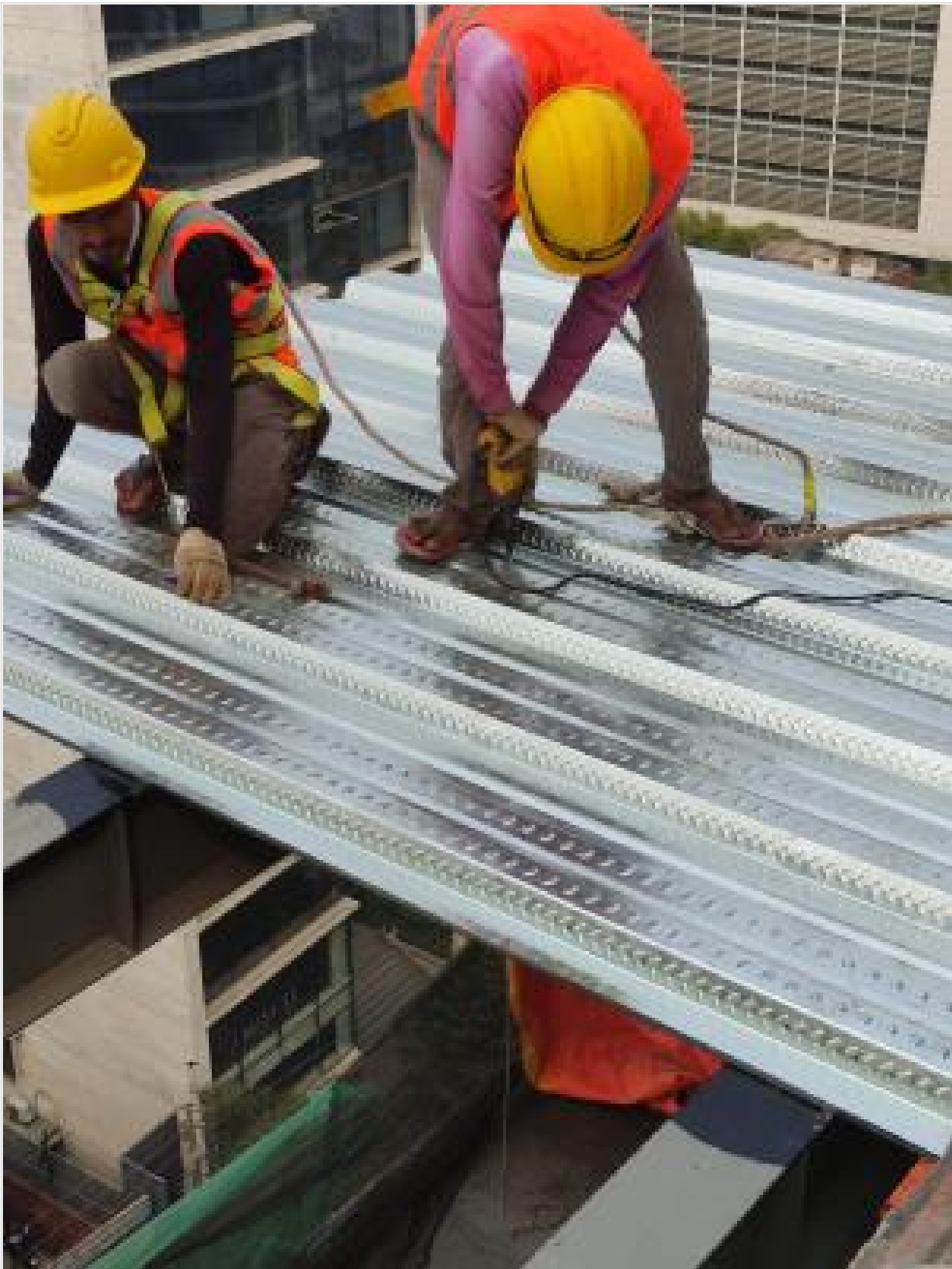
Level-15 Decking Slab fixing on 20-02-23