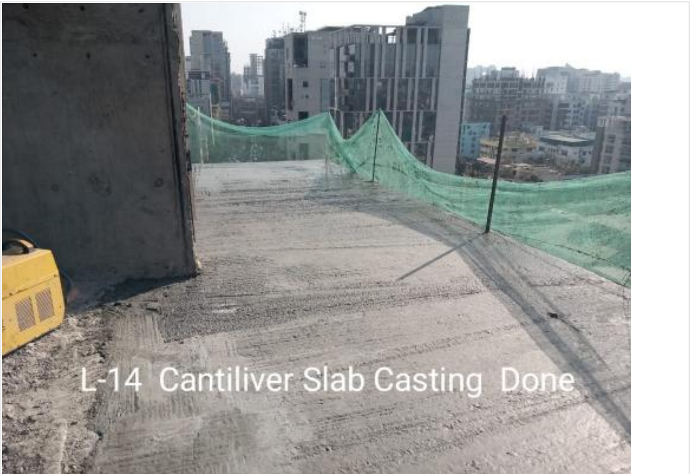
Level-14 Slab concrete completed on 13-02-23