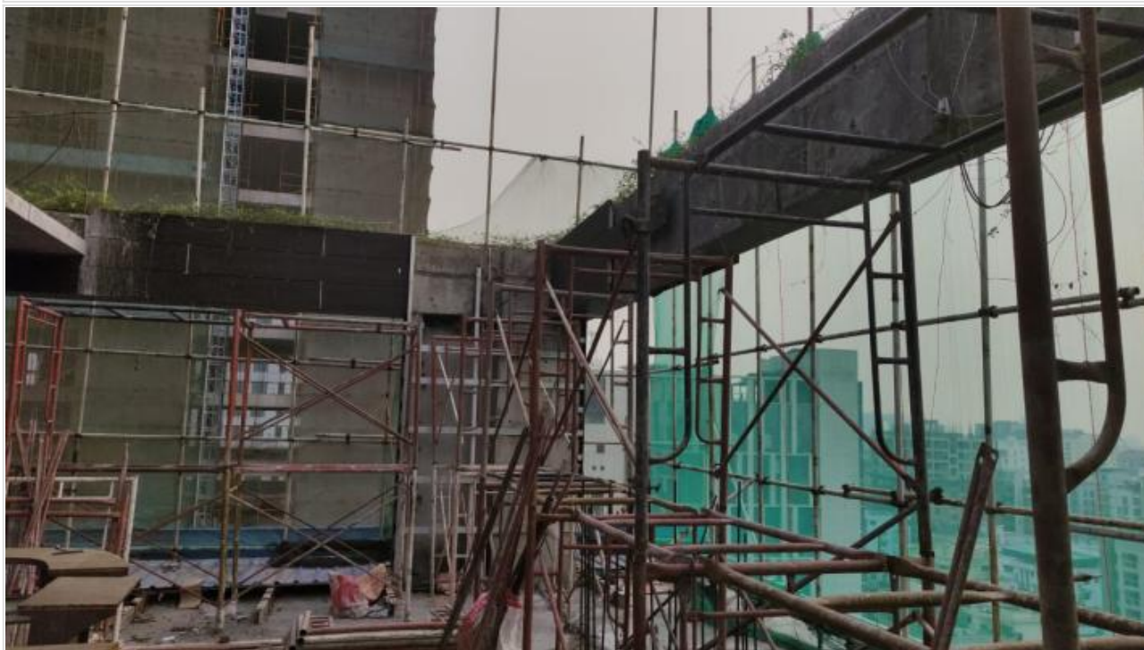
L-16-Safety installation on 18-03-23