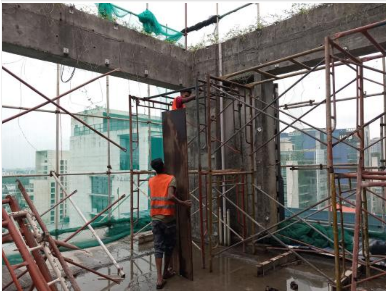
L-16 Scaffolding on 20-03-23