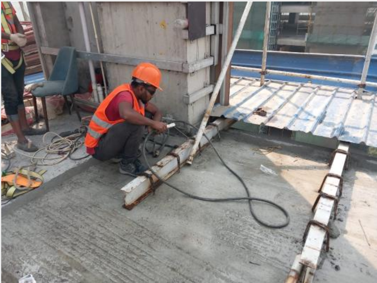
L-16 Safety installation on 09-03-23