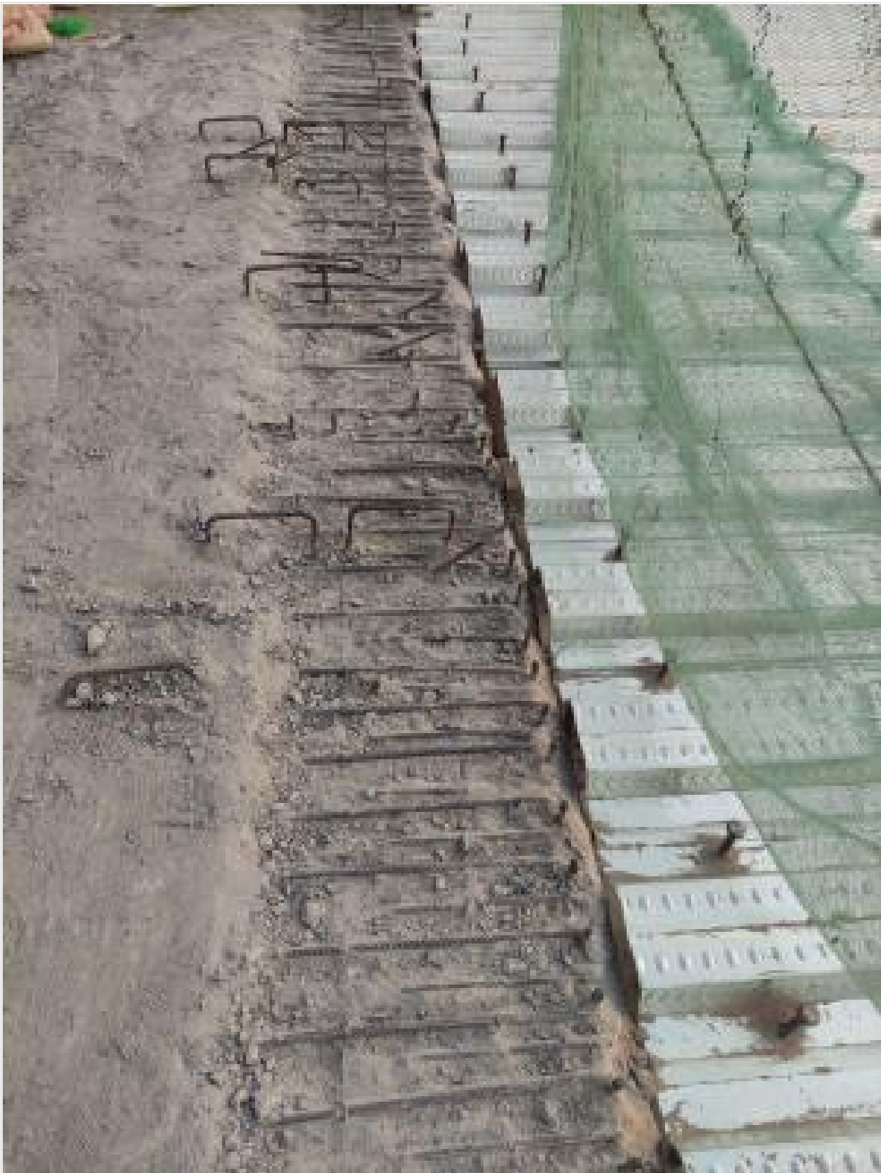
For Re-bar lapping & welding on 22-02-23