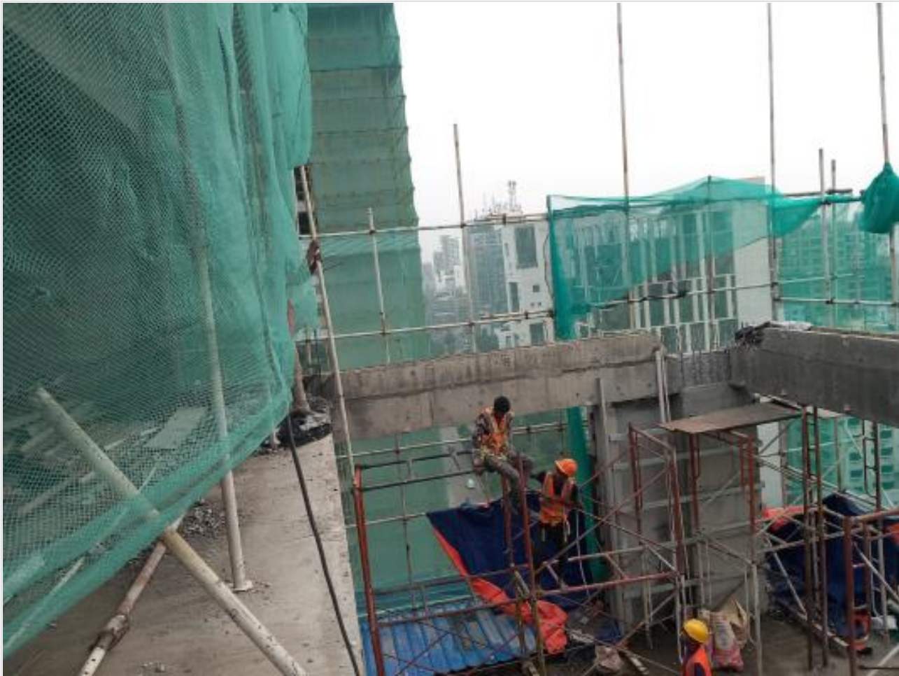
L-16-Scaffolding on 31-03-23