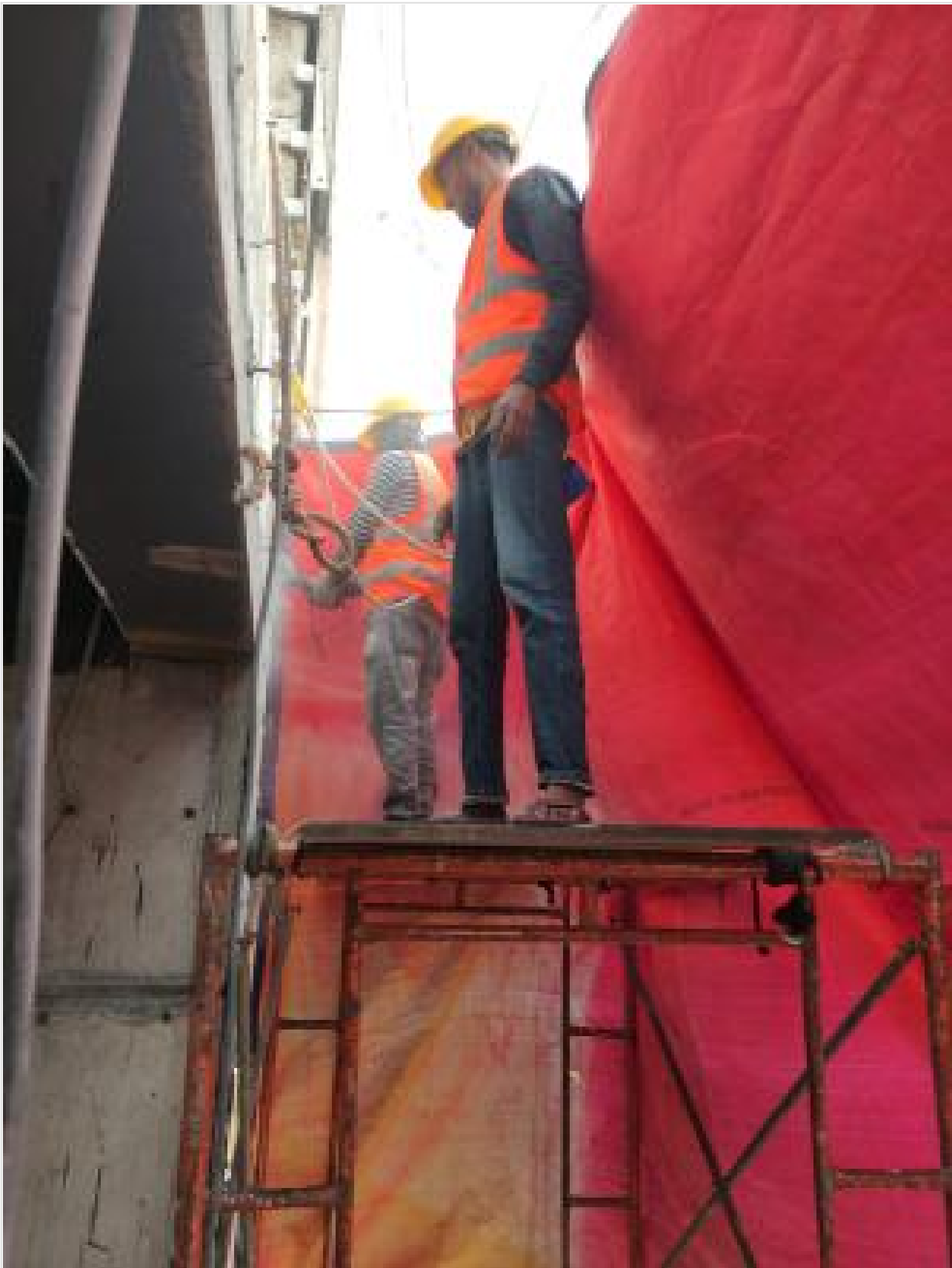
L-15 Anchor bolt drilling on 15-02-23