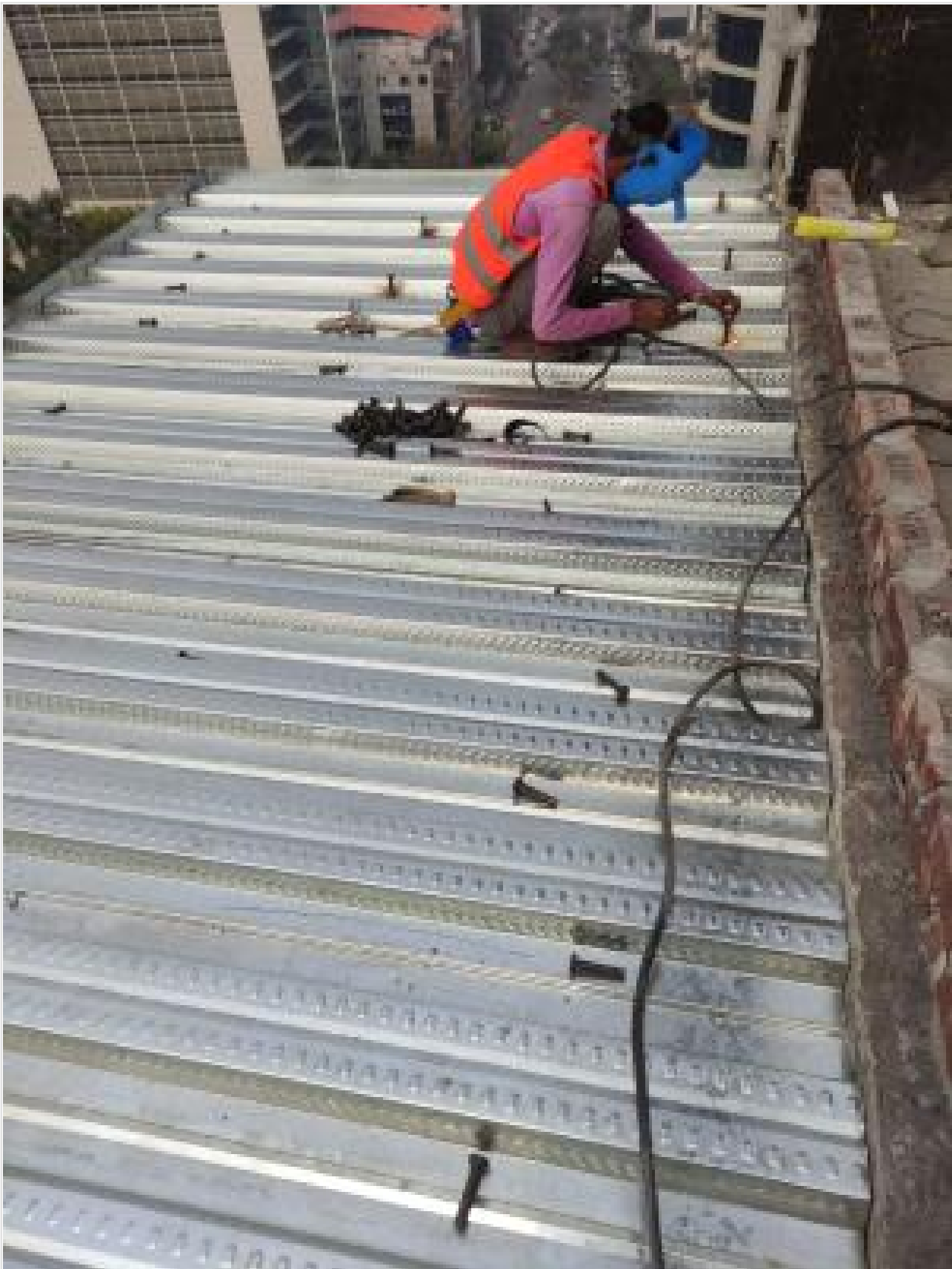
L-15 Decking Slab fixing on 20-02-23