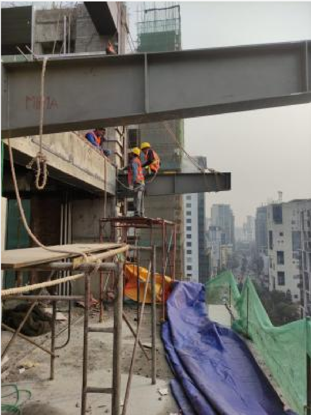
L-15-Steel Fabrication on 18-02-23