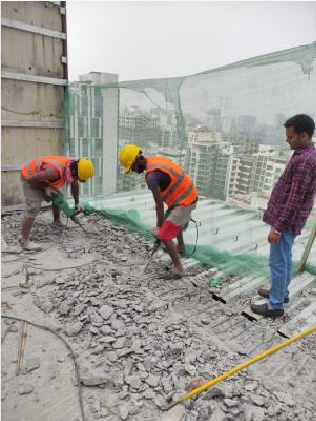
Old Slab concrete chipping on 22-02-23