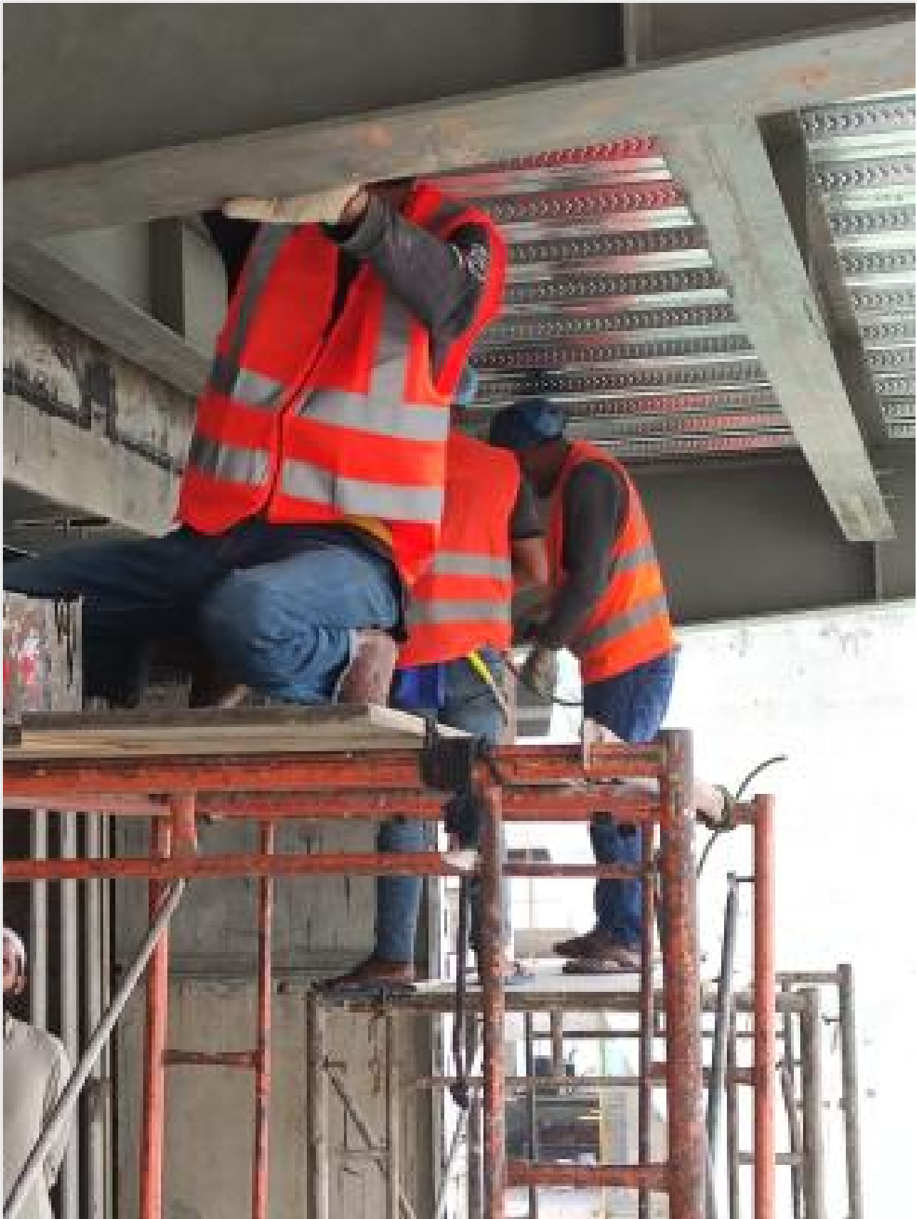
L-14-Ext Decking and Beam Painting on 27-02-23