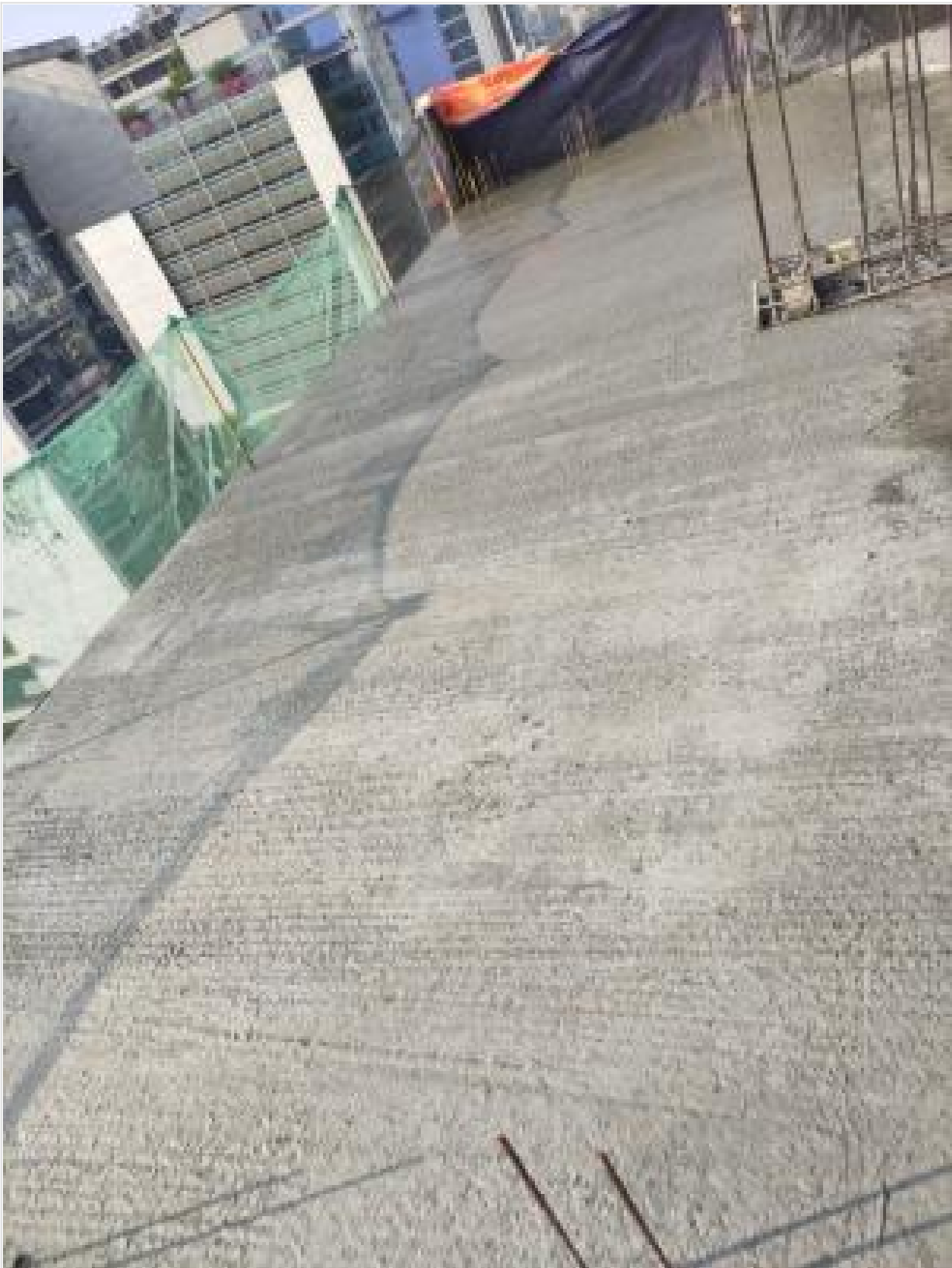
Level-15-Ext Slab Concreting on 25-02-23