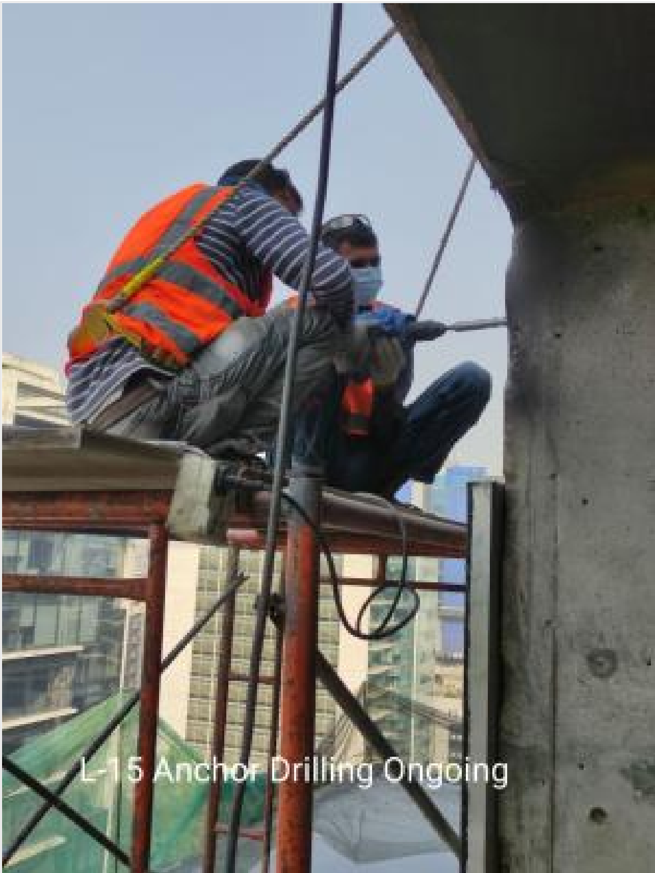
L-15 Anchor bolt drilling on 15-02-23