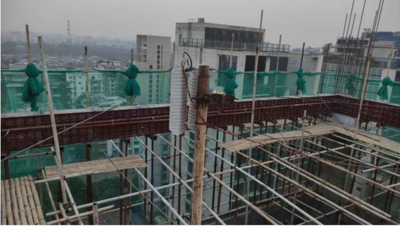
L-16-Beam concreting complete on 19-04-23