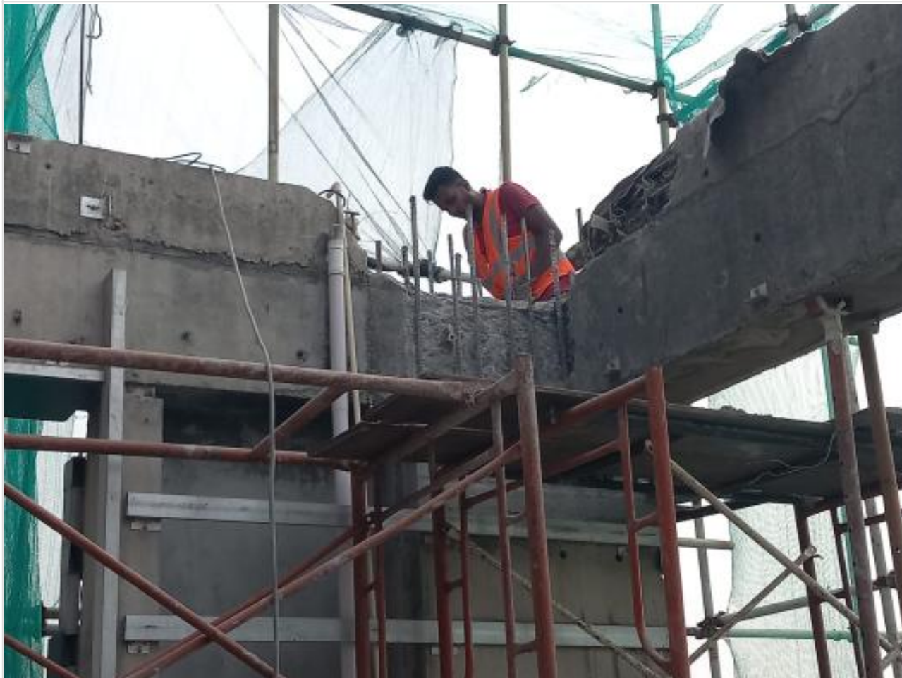
L-16-Existing Column top dismantling on 27-03-23