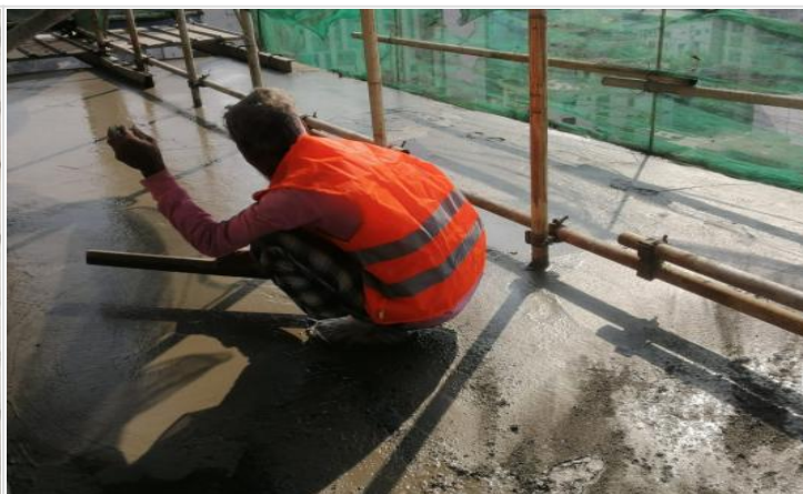
L-15-Toilet Floor CC with NCF on 28-01-24