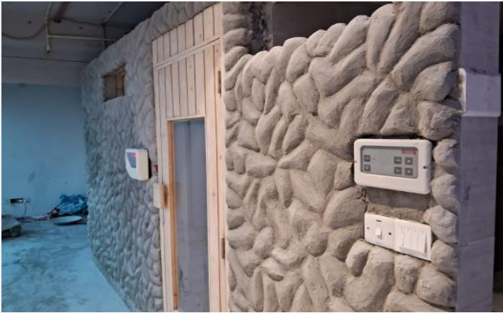
L-11-Outside Design Plaster on 22-01-24