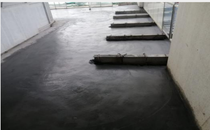
L-14-Floor CC with NCF on 26-01-24