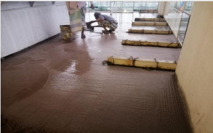
L-15-CC with NCF on 24-01-24