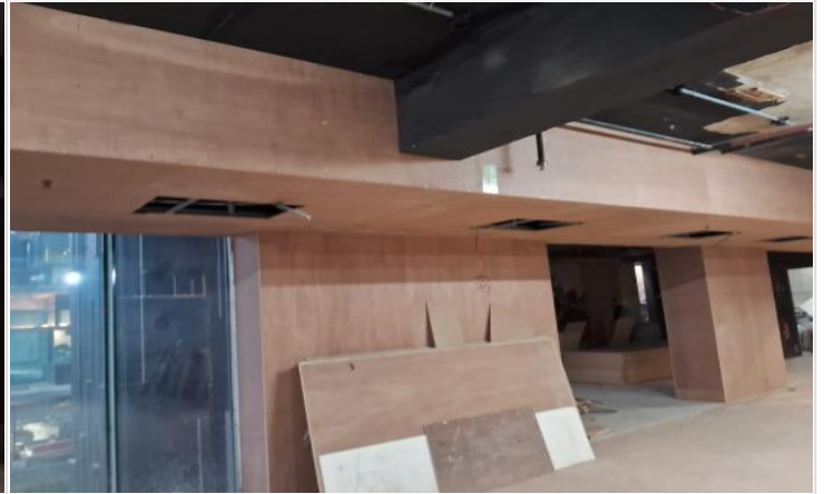
L-14-False Ceiling and Interior on 22-01-24